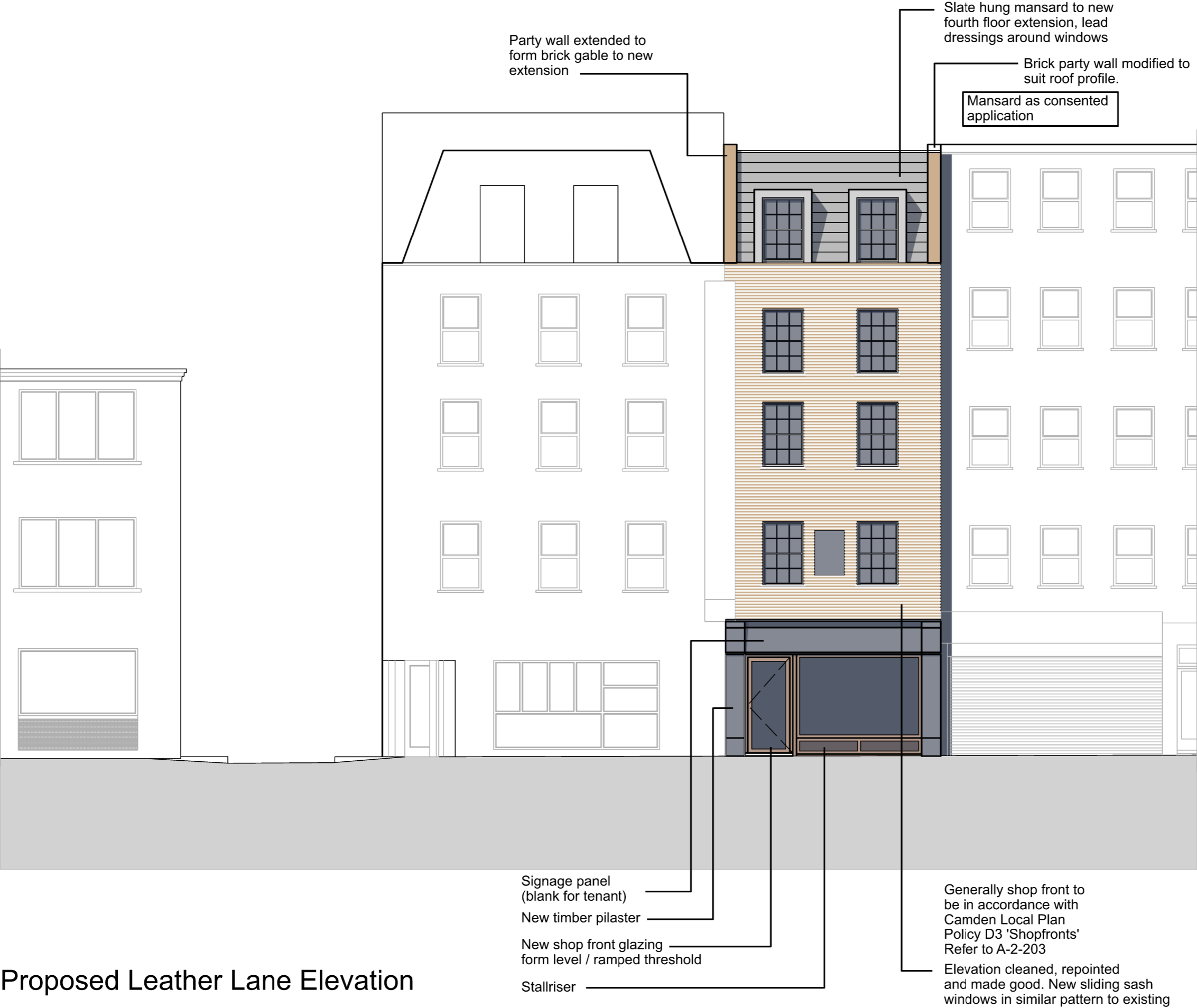
Proposed Leather Lane Elevation