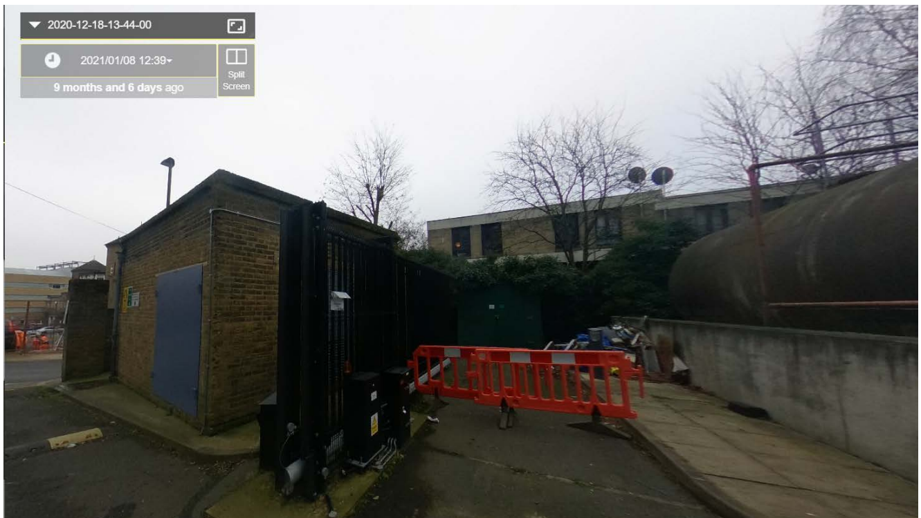
View of existing substation from Highgate West carpark