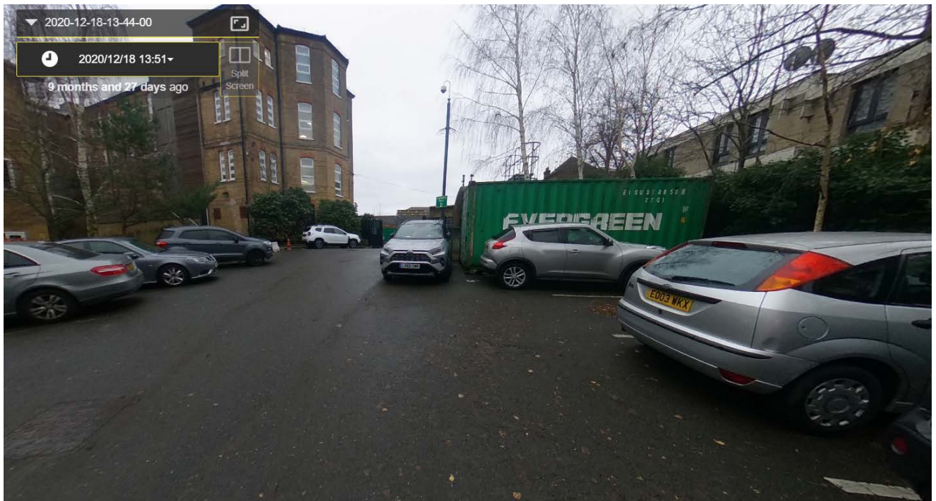
View of existing fuel tank (feeding Highgate West generator) from Highgate West carpark