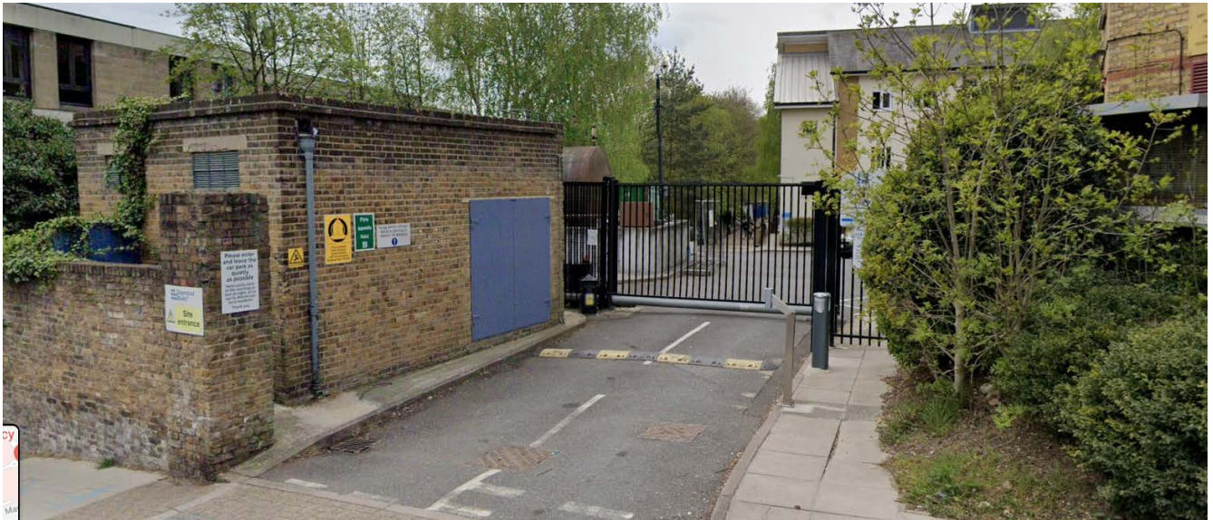
Highgate West carpark – view from Dartmouth Park Hill looking at entrance to Highgate West carpark and existing substation