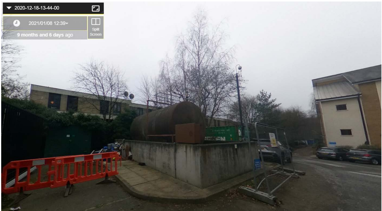
View of existing fuel tank (feeding Highgate West generator) from Highgate West carpark