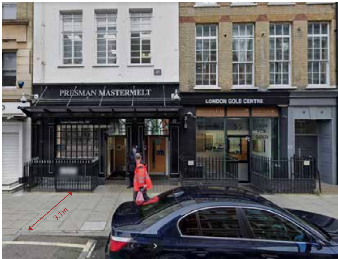
Balustrades around lightwell of 56 Hatton Garden entrance