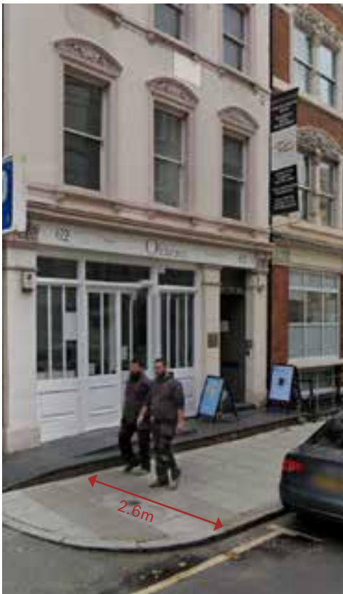
Ramp on the side of 60 Hatton Garden entrance