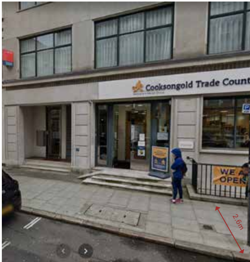
Ramp and steps infront of 50 Hatton Garden entrance