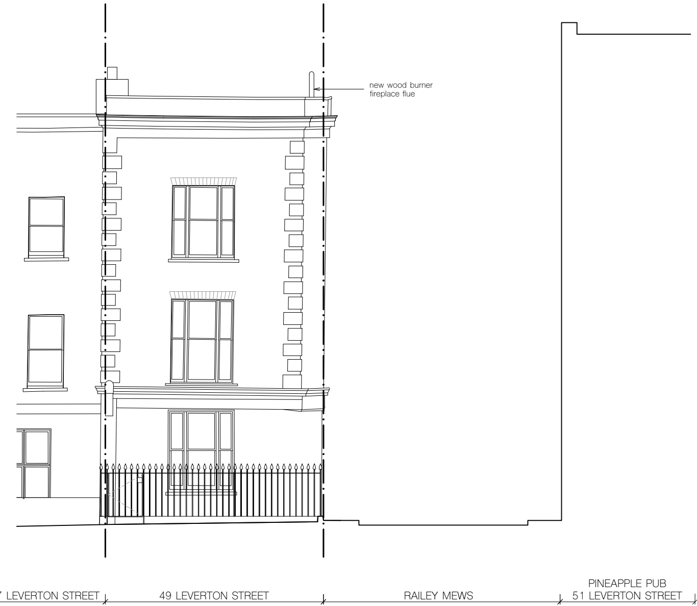
1 Proposed front elevation