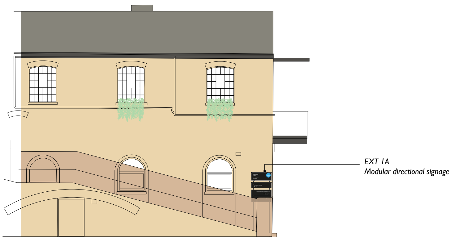
06 PROPOSED NORTH ELEVATION SCALE 1:100 @A1