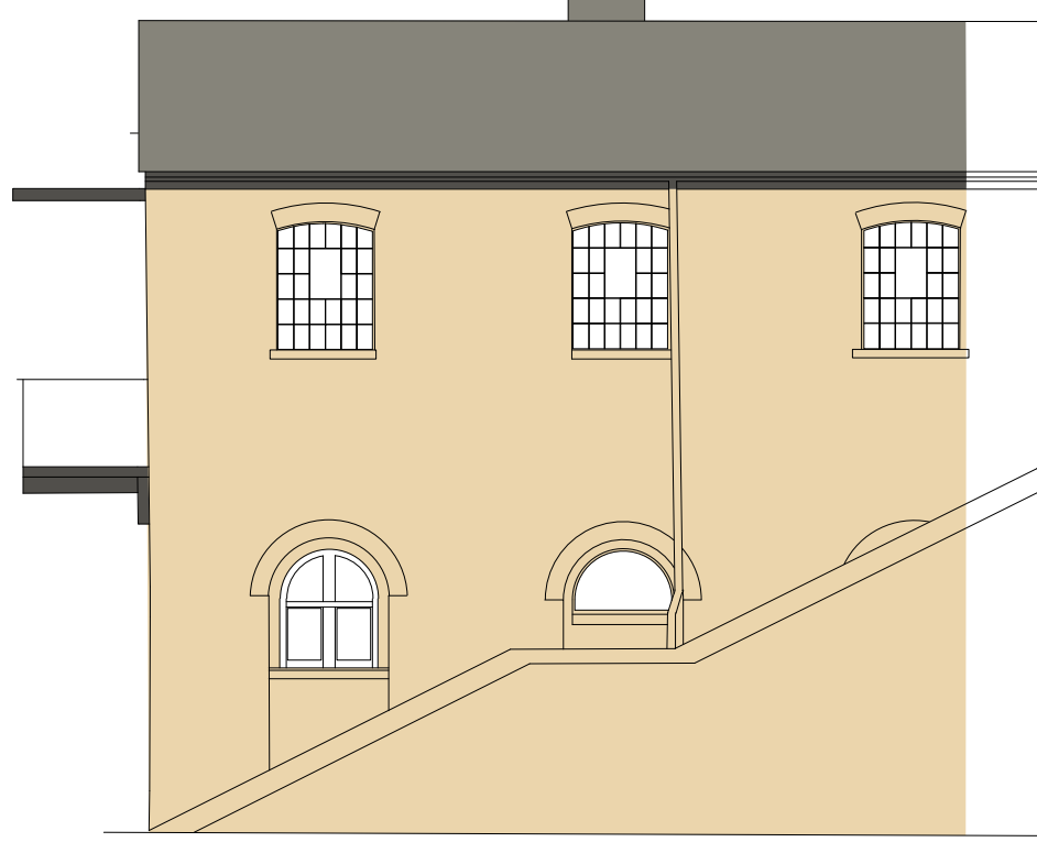
05 EXISTING SOUTH ELEVATION SCALE 1:100 @A1