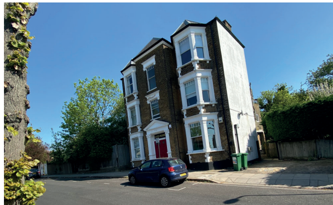
Opposite side of Gondar Gardens - large 3 storey unit