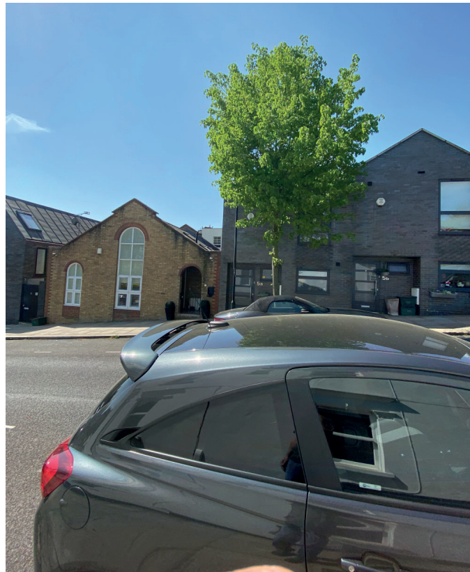
Looking down Gondar Gardens - differing heights of existing units