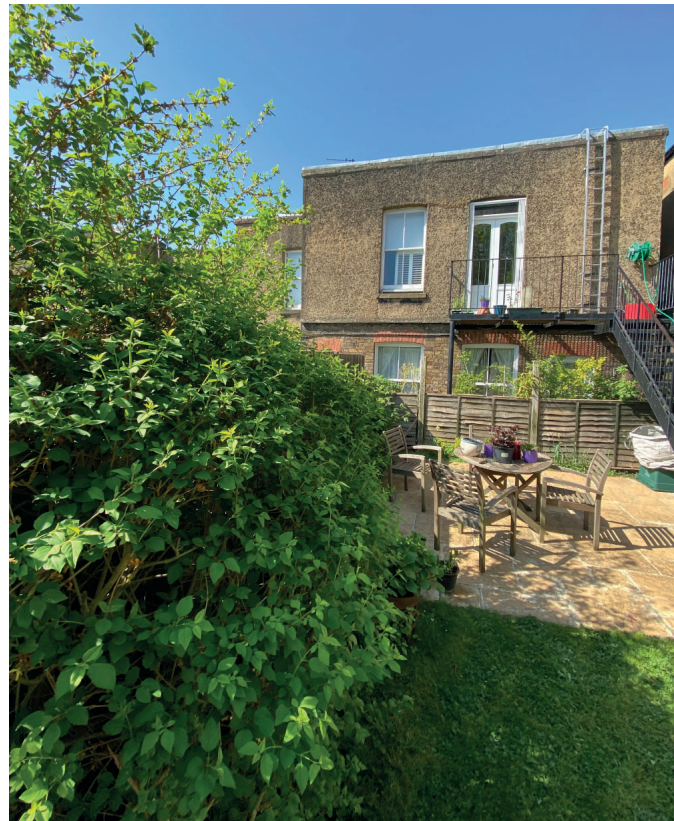
Rear of No.12 Sarre Road with fencing and screening to ground floor