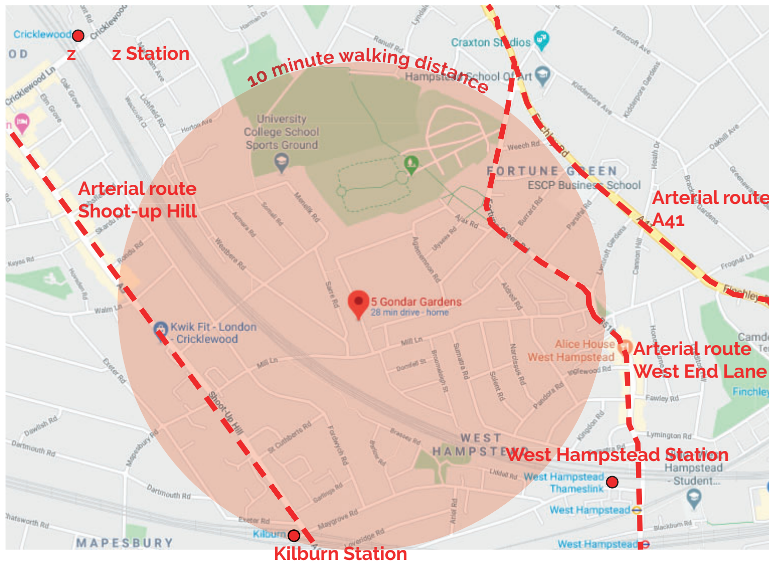
Local access routes diagram