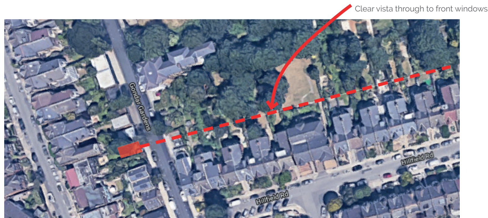
Site plan to show no overlooking issues with terrace