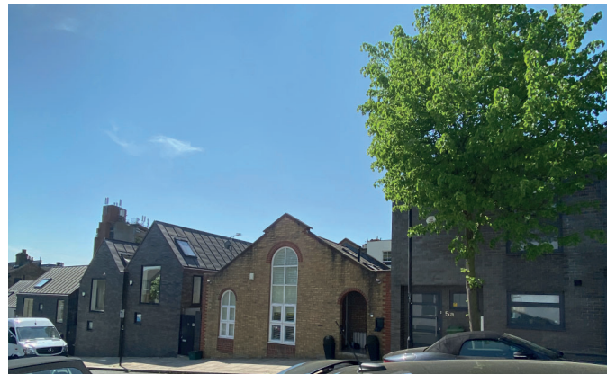
Further down Gondar Gardens with differing styles