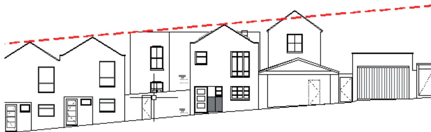
Street elevation illustrating slope and heights