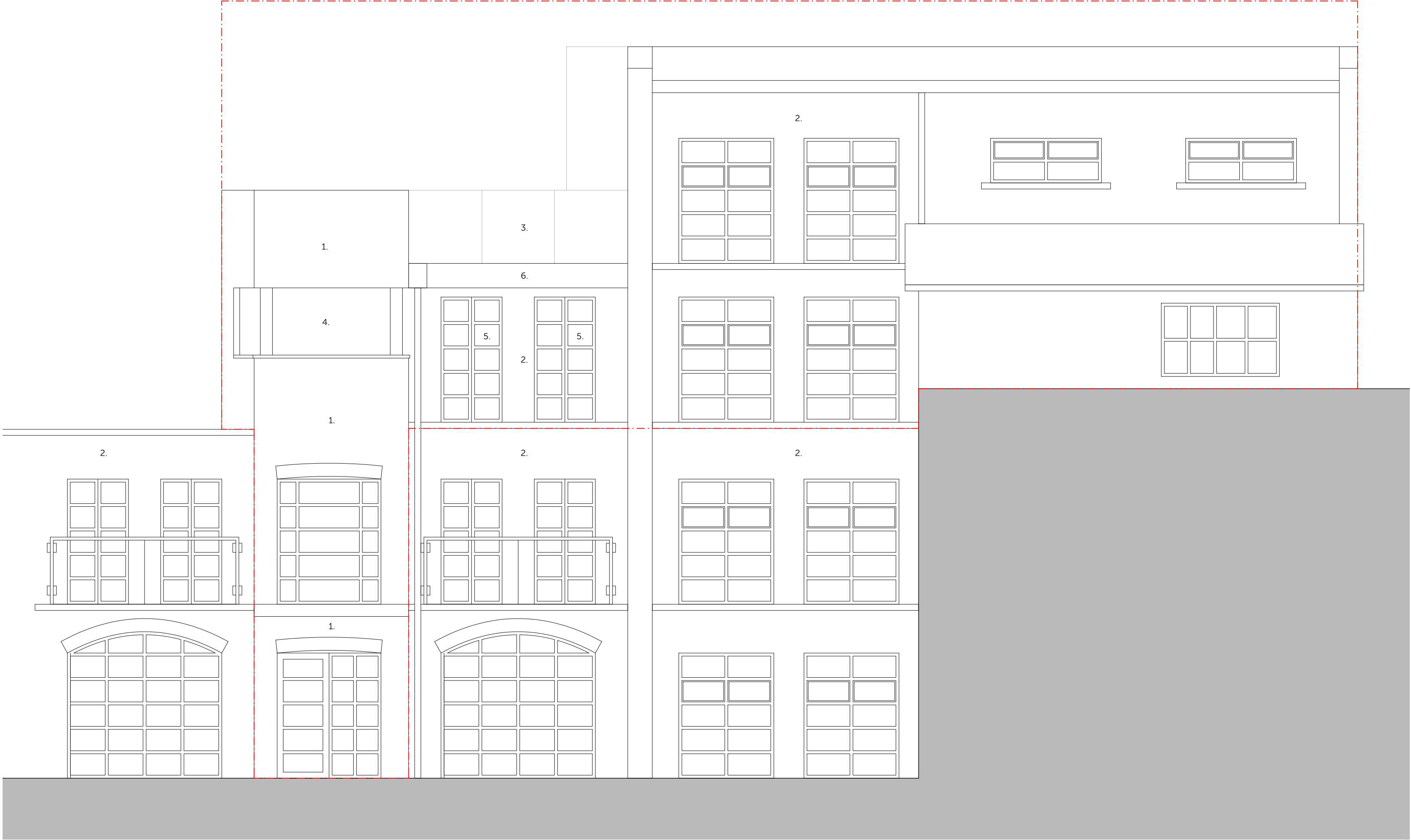
01 PROPOSED NORTH ELEVATION 1:50 @ A1