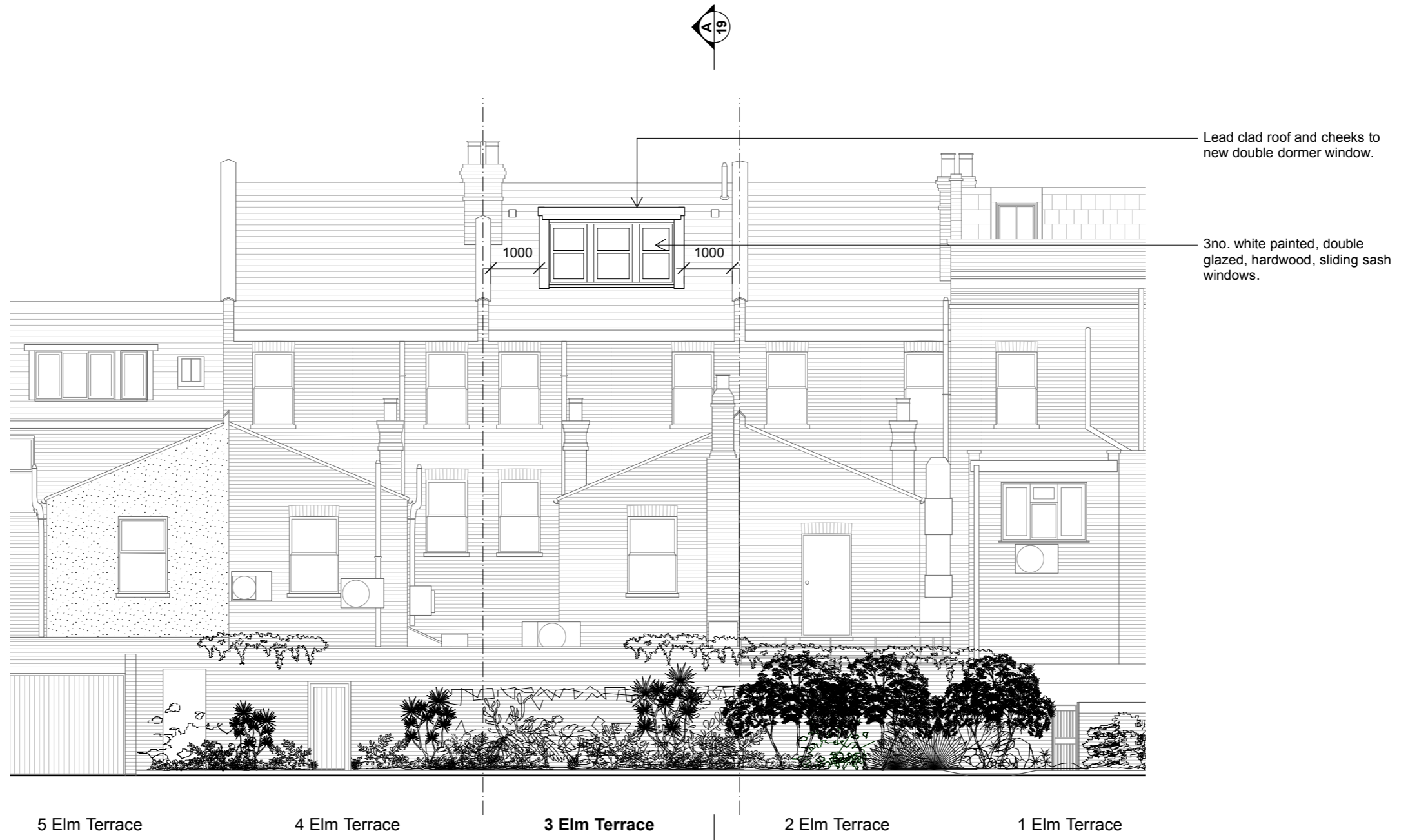
20_Rear Elevation - Proposed

NOTES: © t A Greig Limited- All rights described in Chapter IV of the Copyright, Designs and Patents Act 1988 have been asserted. This drawing is to be read in conjunction with the specification and all relevant drawings. Contractor to check all dimensions on site. Do not scale from this drawing. t A Greig Limited to be advised of any variation between the drawings and site conditions.