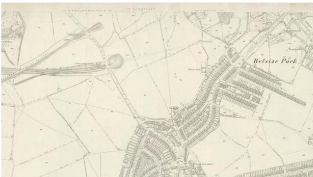
Ordnance Survey, 1870

Historical records show that until the 19th century the Fortune Green and West Hampstead area was largely rural farmland. It centred on the hamlet of West End, which was within the manor and parish of Hampstead. From the 1840s onwards the establishment of the East and West India Docks and Birmingham Junction Railway began construction of a line from Poplar to Camden Town. By the 1860s the Hampstead tunnel had been dug, enabling the railway to extend further west linking Camden to Willesden Junction via West Hampstead. The arrival of what then became known as the North London Railway brought rapid development with the following 30 years leaving a distinctive legacy of many attractive buildings. These include individual houses, terraced housing, mansion blocks. The area also had many areas of distinctive streetscape of large brick built properties.