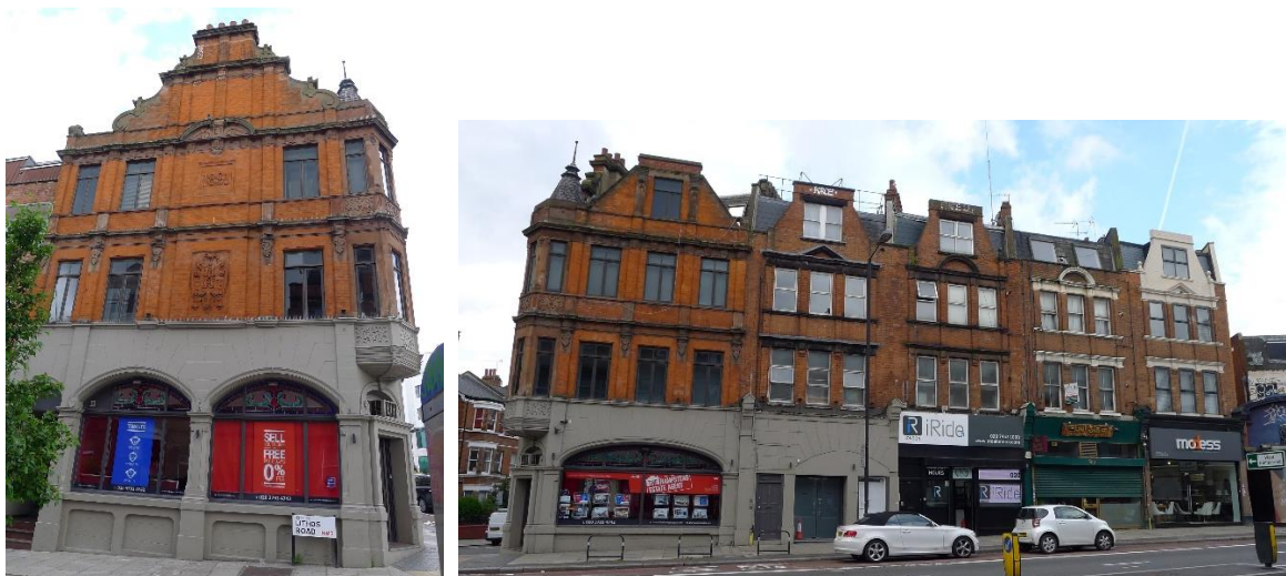
The south elevation of no. 307 Finchley Road; the east-facing Finchley Road frontage of nos. 307 – 311.

Nos. 307 – 309 Finchley Road forms part of a larger discontinuous group of buildings, bisected by the entrance to Lithos Road, which are included on Camden Council's schedule of Locally Listed Buildings. The full local list entry is: