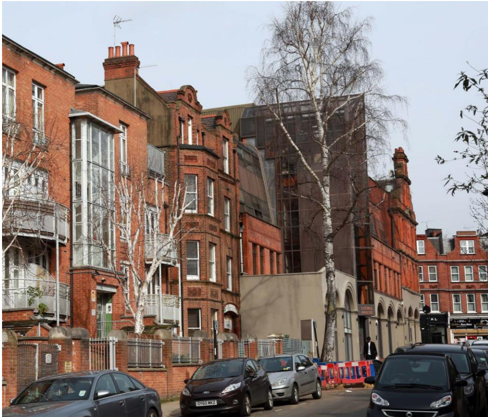
Existing view along Lithos Road