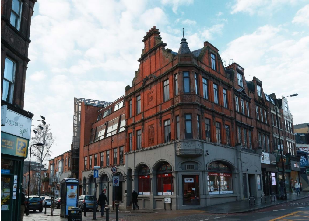
Existing view from Finchley Road

The revised application proposals have taken on board these points. The following images illustrate the existing and proposed development scheme: