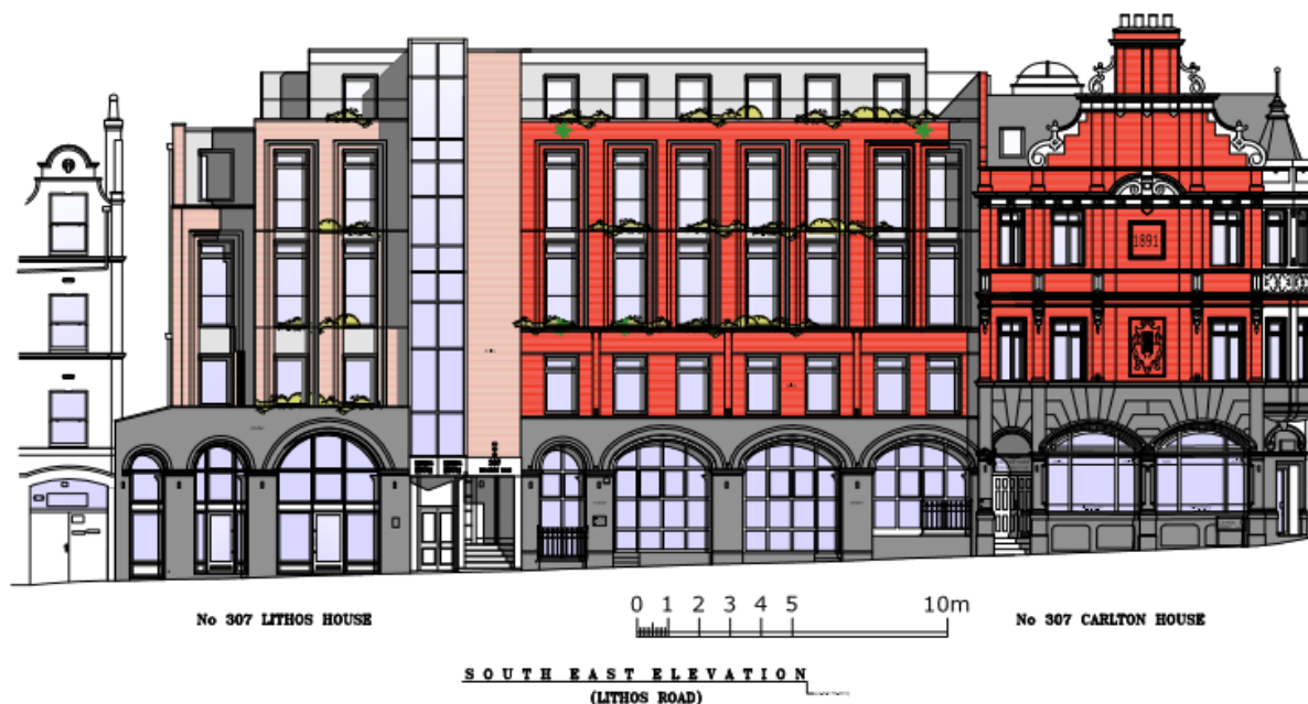
Proposed elevation drawing