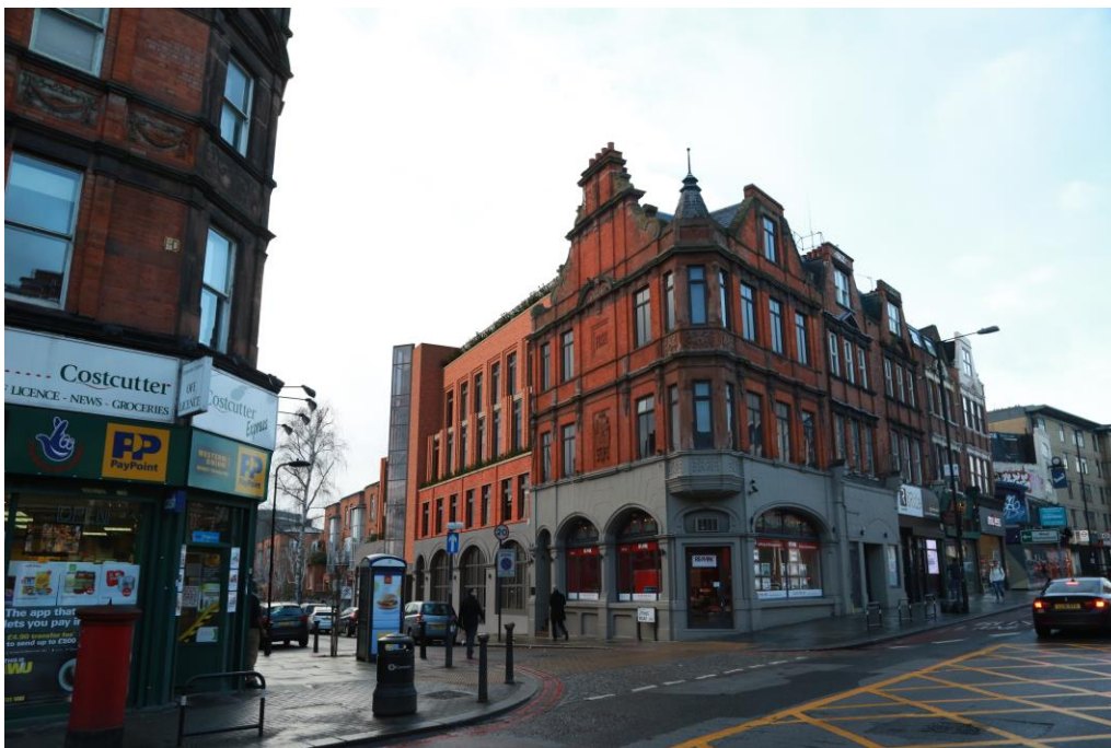
Proposed view from Finchley Road