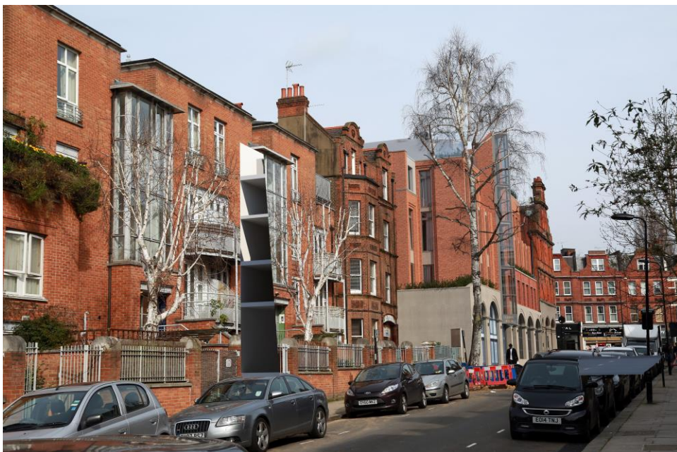
Proposed view along Lithos Road