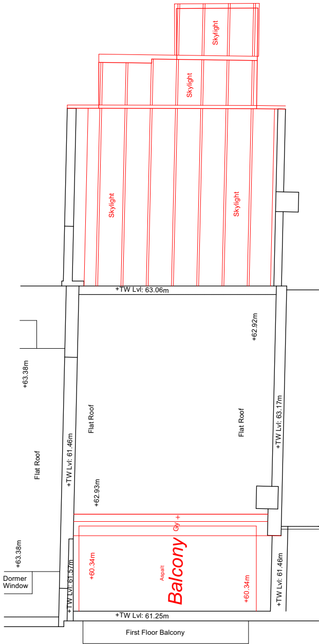
1 Existing Roof Plan 1:100