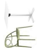
EXAMPLES OF FURNITURE

NOTE: loose tables & chairs + branded seating barriers to be brought inside outside of trading hours