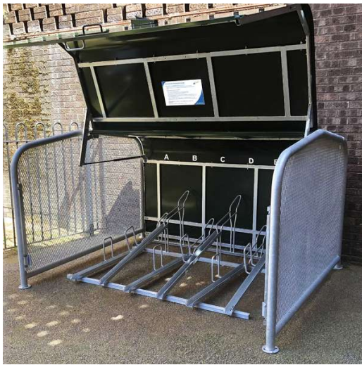
Reference images for FalcoPod Hangars