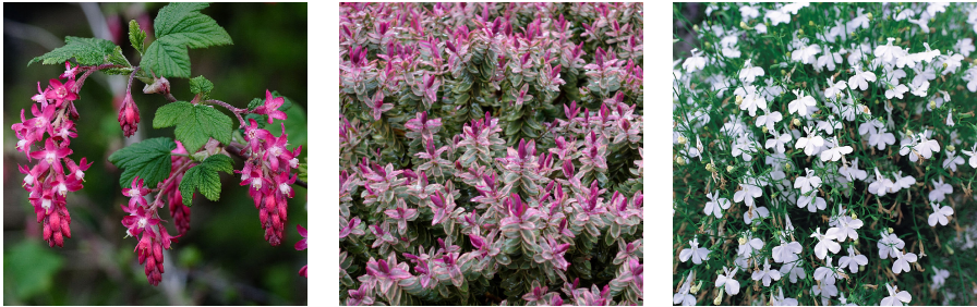
Reference images for Flowering Currants, Hebe, and Fountain White