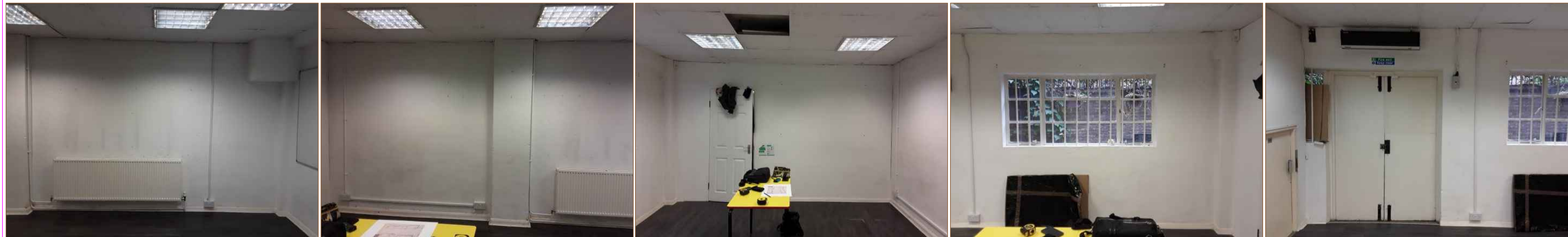
VIEW N. 1