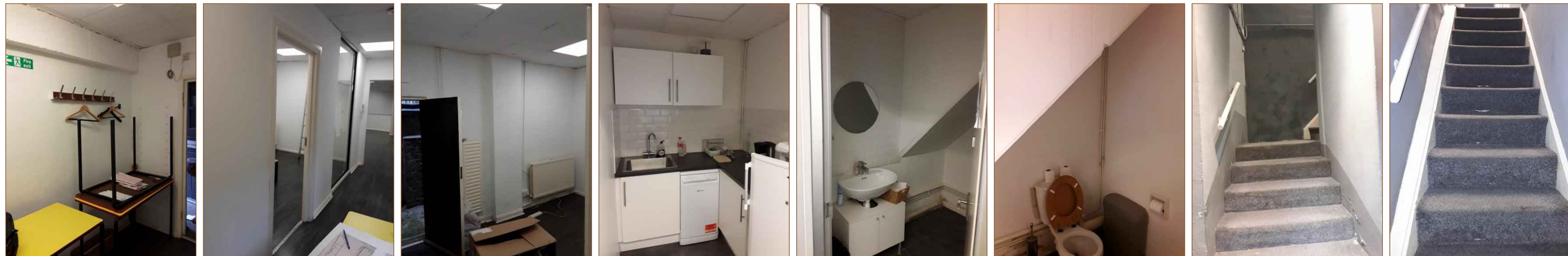
VIEW N. 6