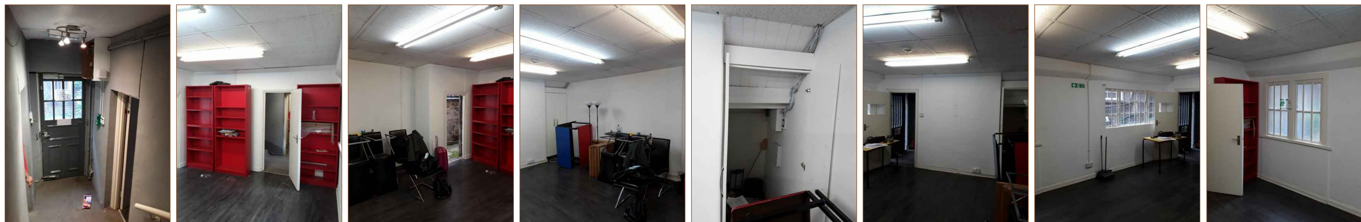
VIEW N. 14