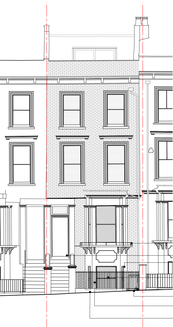
STREET ELEVATION - NW