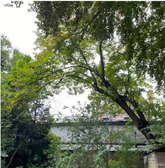
A- T1; Small-leaved lime ( Tilia cordata )