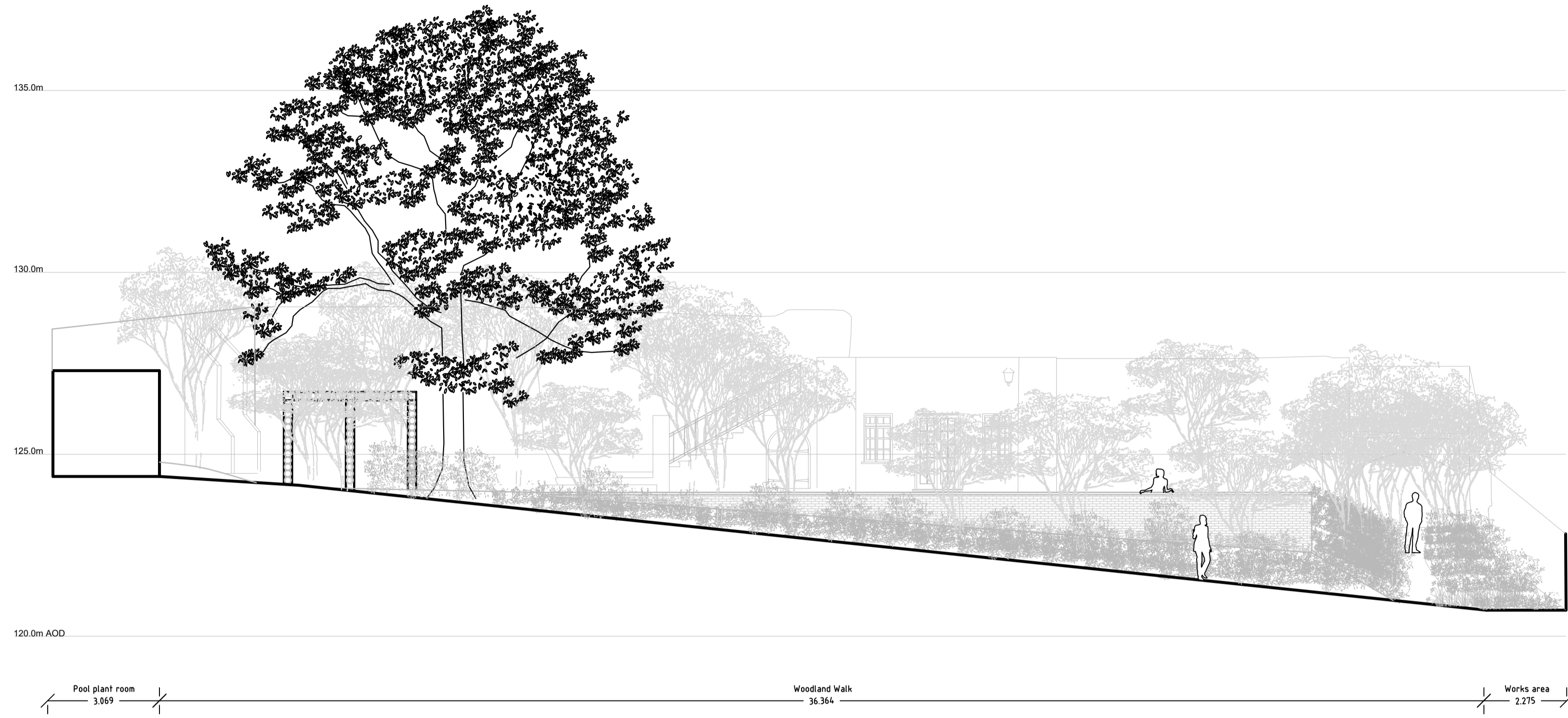
Section EE' Scale 1:100