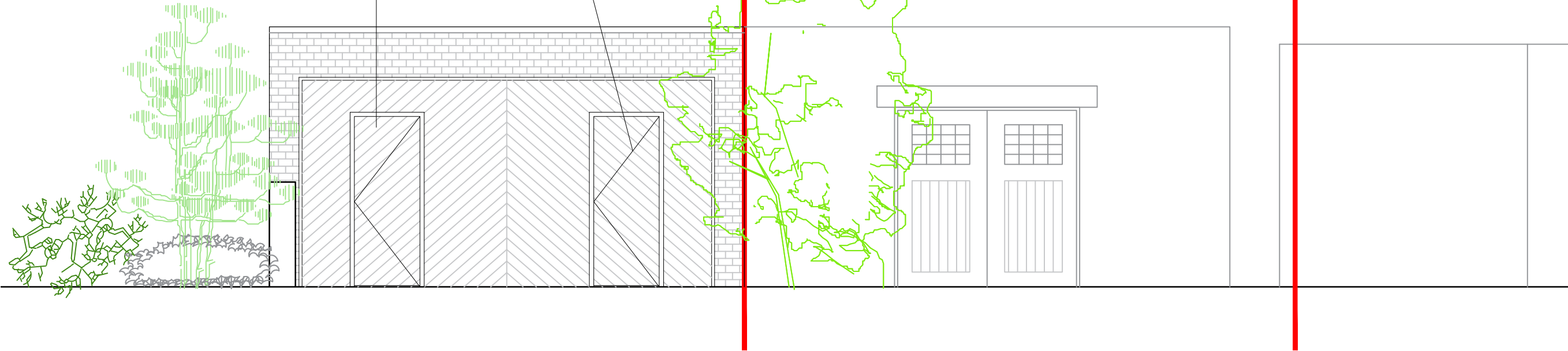
PROPOSED ELEVATION AA (GARAGE) - 1:50@A3

Retain existing garage doors to be fixed in place with insulation and added glazed hatches with lockable doors on exterior