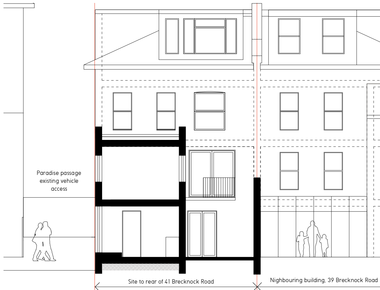
02 | Existing Section BB