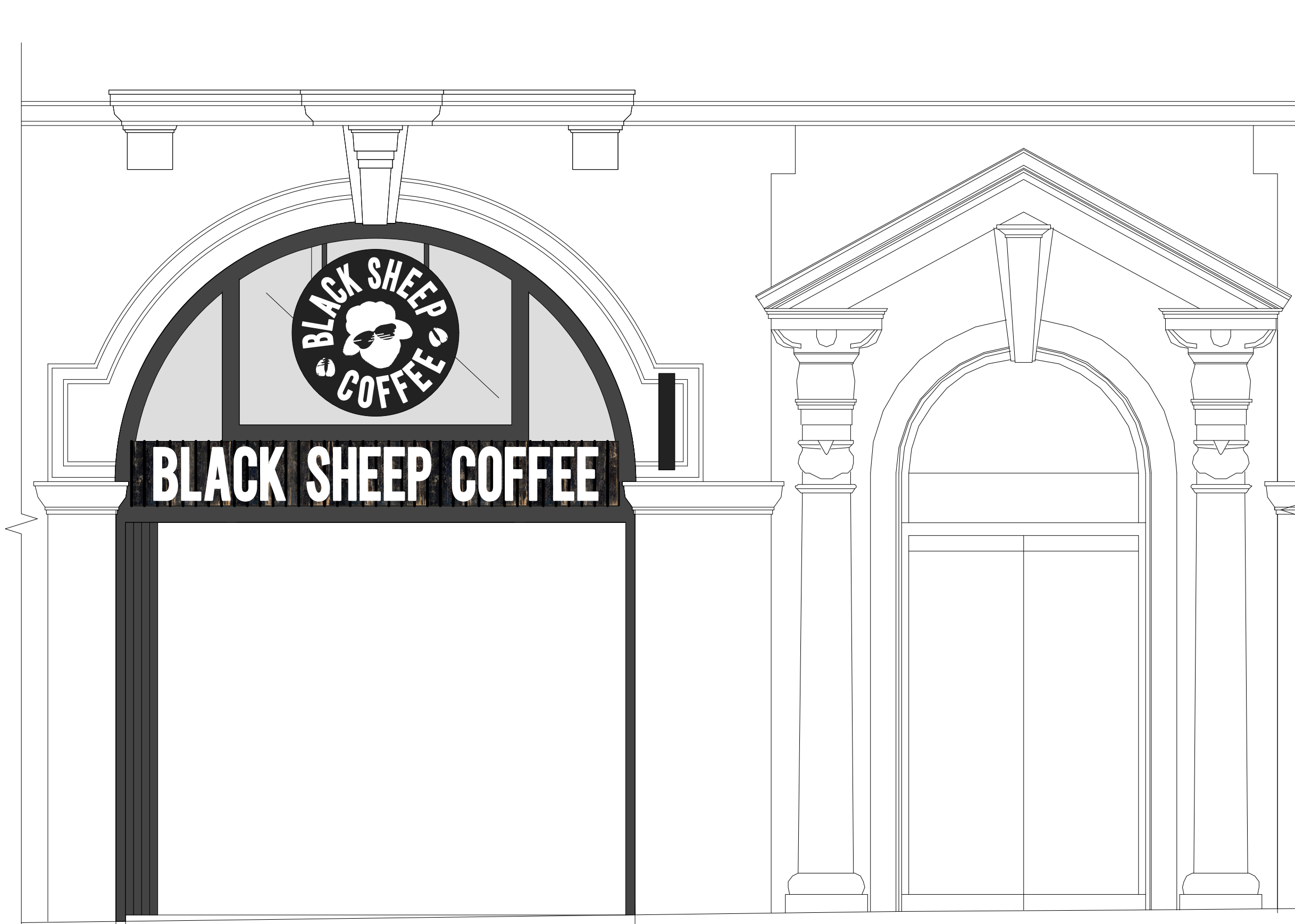
1 PROPOSED SHOPFRONT - DOORS IN CLOSED POSITION SCALE 1:25 @ A1

ENTRANCE TO BUILDING RECEPTION LOBBY AND COMMON PARTS