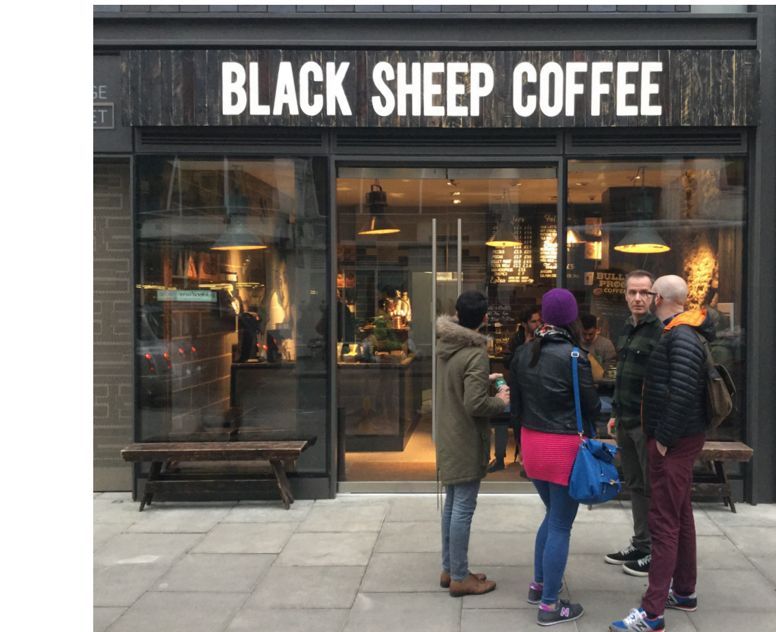
4 PHOTOGRAPH - REFERENCE IMAGE - FASCIA PANEL NOT TO SCALE

DO NOT SCALE FROM THIS DRAWING. THE AUTHOR OF THIS DRAWING TAKES NO RESPONSIBILITY FOR ANY DIMENSIONS OBTAINED BY MEASURING OR SCALING FROM THIS DRAWING AND NO RELIANCE MAY BE PLACED ON SUCH DIMENSIONS. ALL DIMENSIONS MUST BE CHECKED AND VERIFIED ON SITE BY THE CONTRACTOR BEFORE COMMENCING ANY WORK OR PRODUCING DRAWINGS. THE FRUITFUL DESIGN CONSULTANCY LTD. (HEREAFTER REFERRED TO AS FRUITFUL) MUST BE NOTIFIED IMMEDIATELY OF ANY ERRORS OR DISCREPANCIES PRIOR TO THE COMMENCEMENT OF WORK.