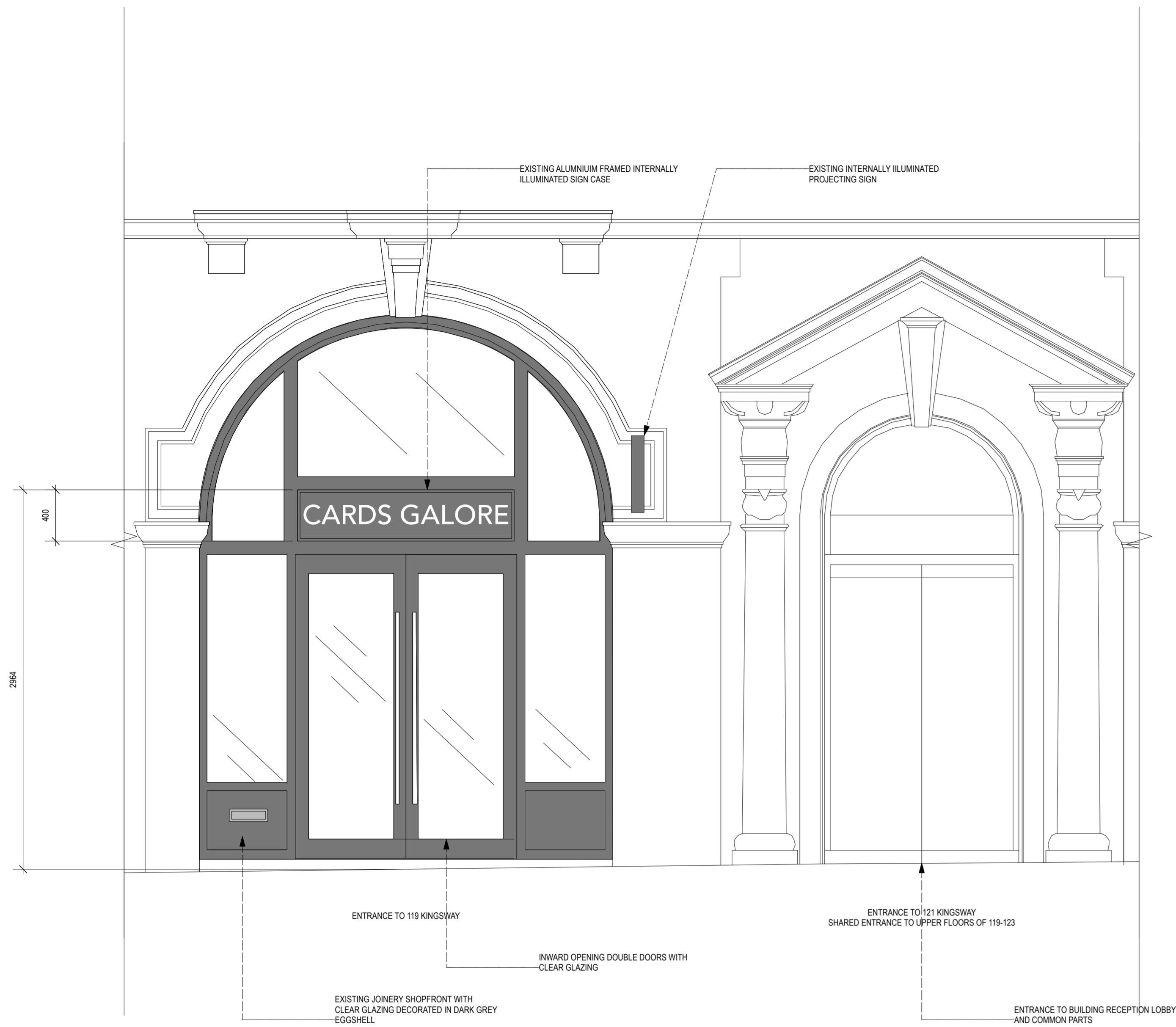
1 EXISTING SHOPFRONT - DOORS IN CLOSED POSITION SCALE 1:25 @ A1