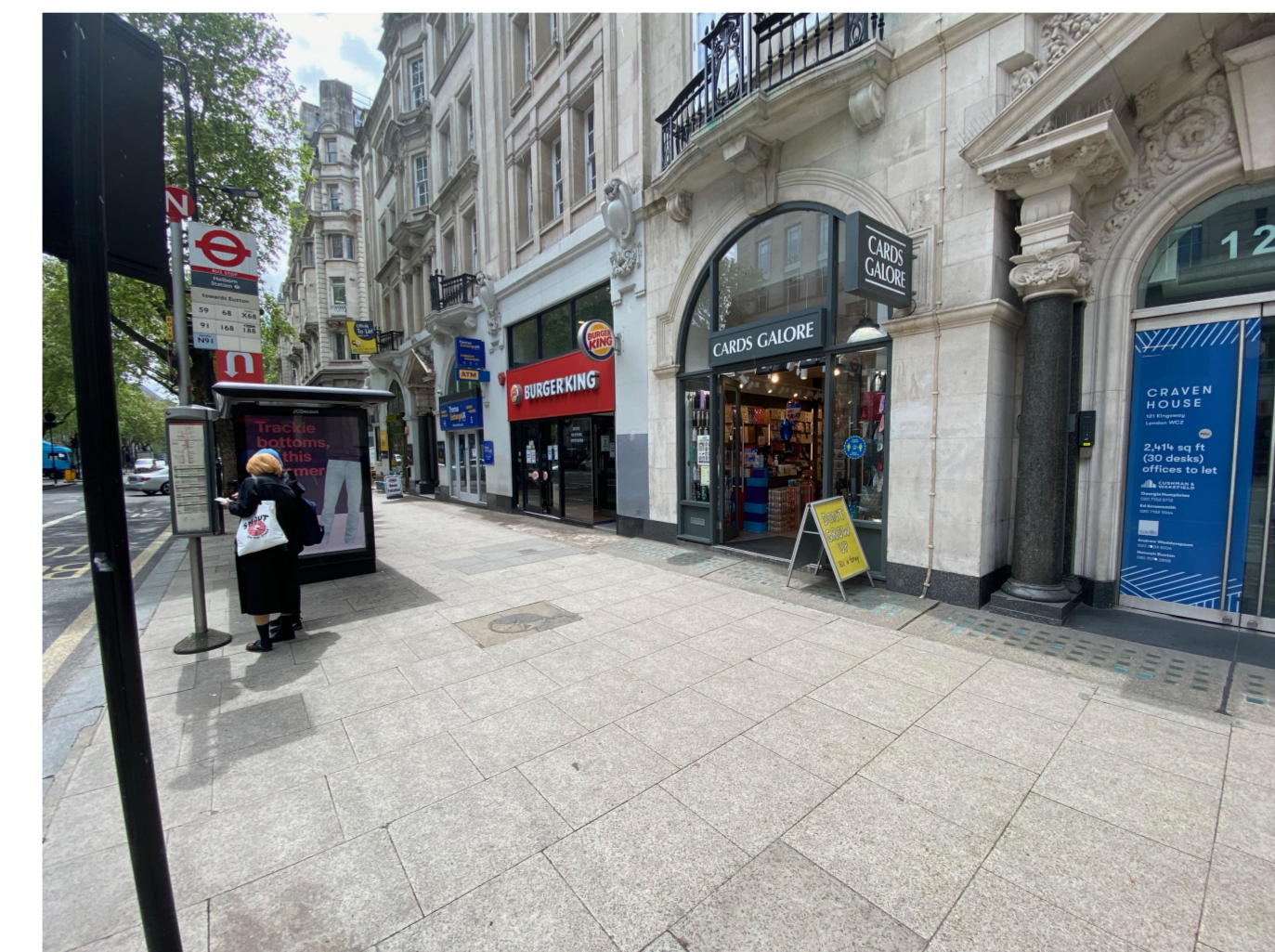
3 PHOTOGRAPHS OF EXISTING SHOPFRONT AND SIGNAGE NOT TO SCALE