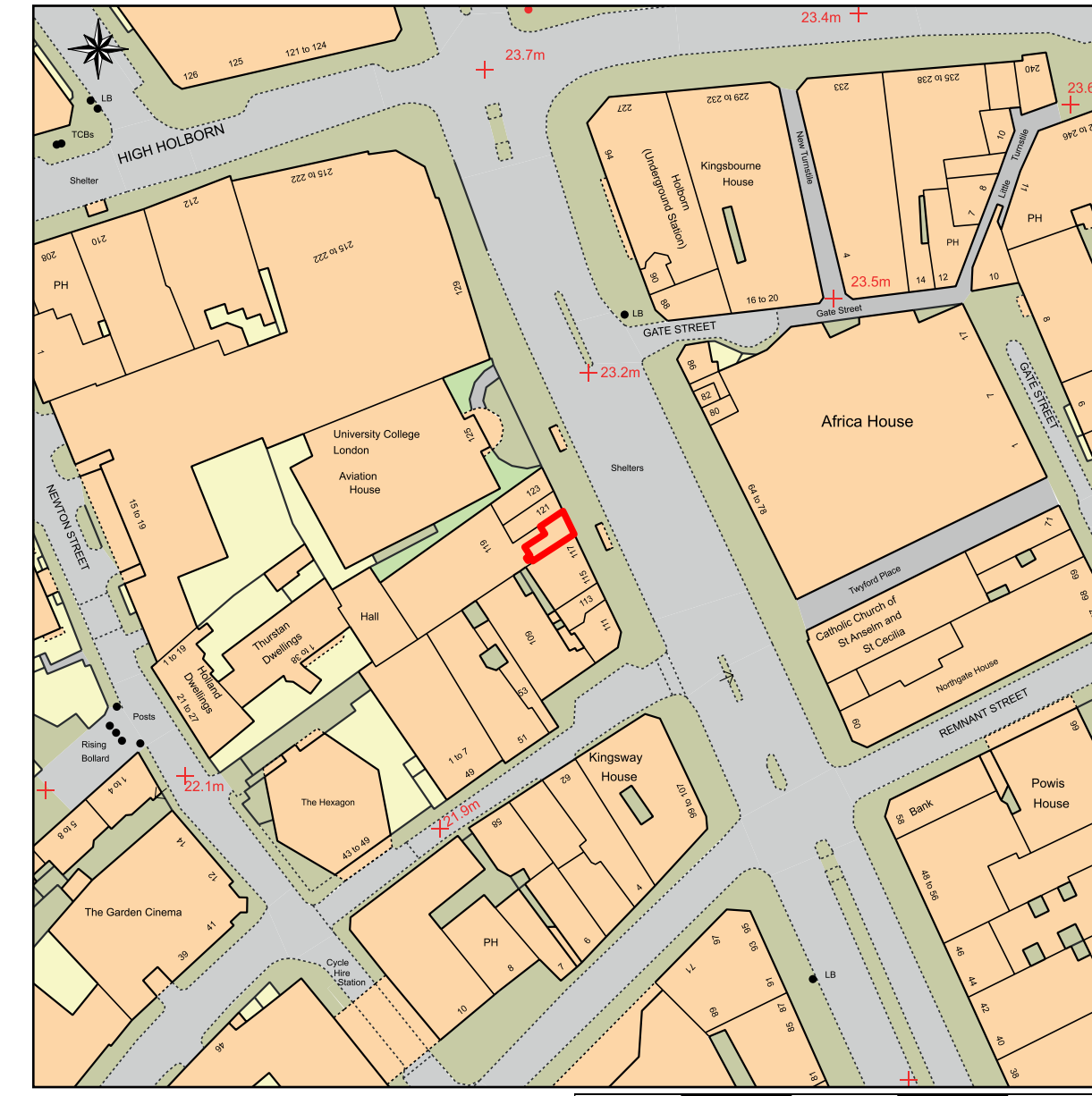
This Plan includes the following Licensed Data: OS MasterMap Colour PDF Location Plan by the Ordnance Survey National Geographic Database and incorporating surveyed revision available at the date of production. Reproduction in whole or in part is prohibited without the prior permission of Ordnance Survey. The representation of a road, track or path is no evidence of a right of way. The representation of features, as lines is no evidence of a property boundary. Scale: 1:1250, paper size: A1