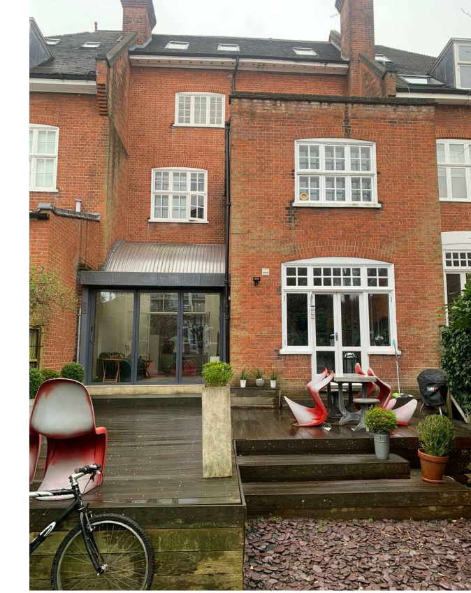
5 ELDON GROVE REAR ELEVATION