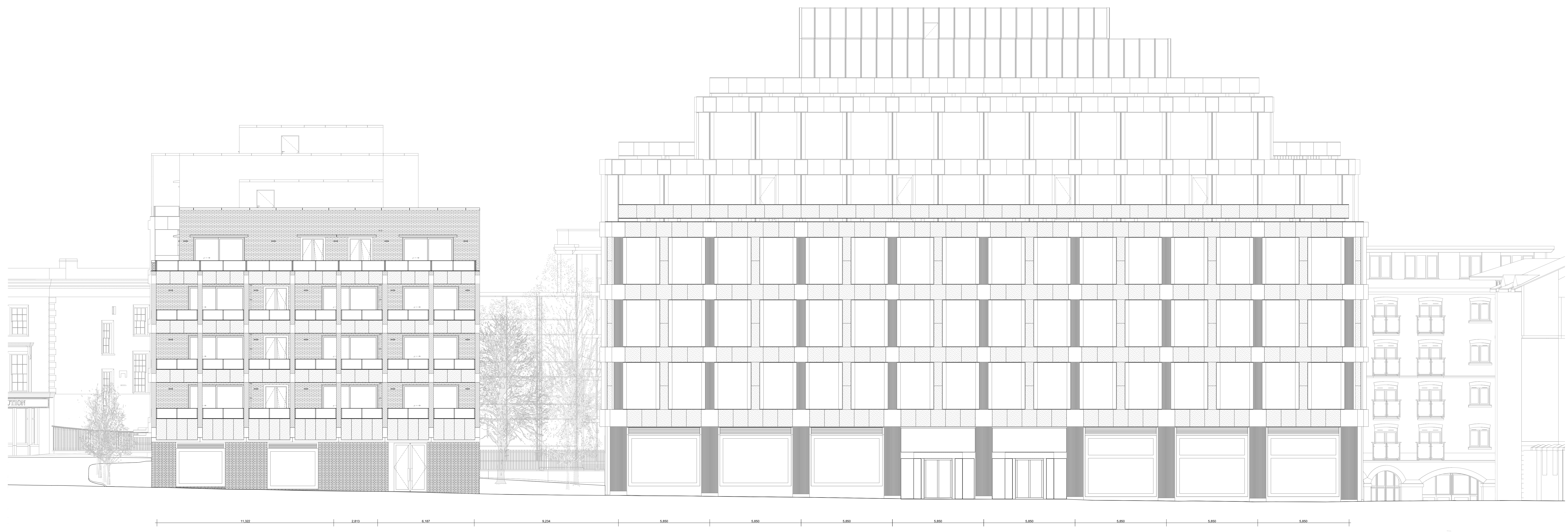
Elevation - Royal College Street