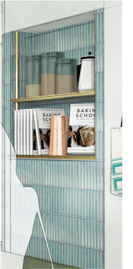
Shelving visual reference

FULL SITE SURVEY REQUIRED PRIOR TO STARTING WORKS ON SITE, EXISTING DIMENSIONS SHOWN AS INDICATIVE