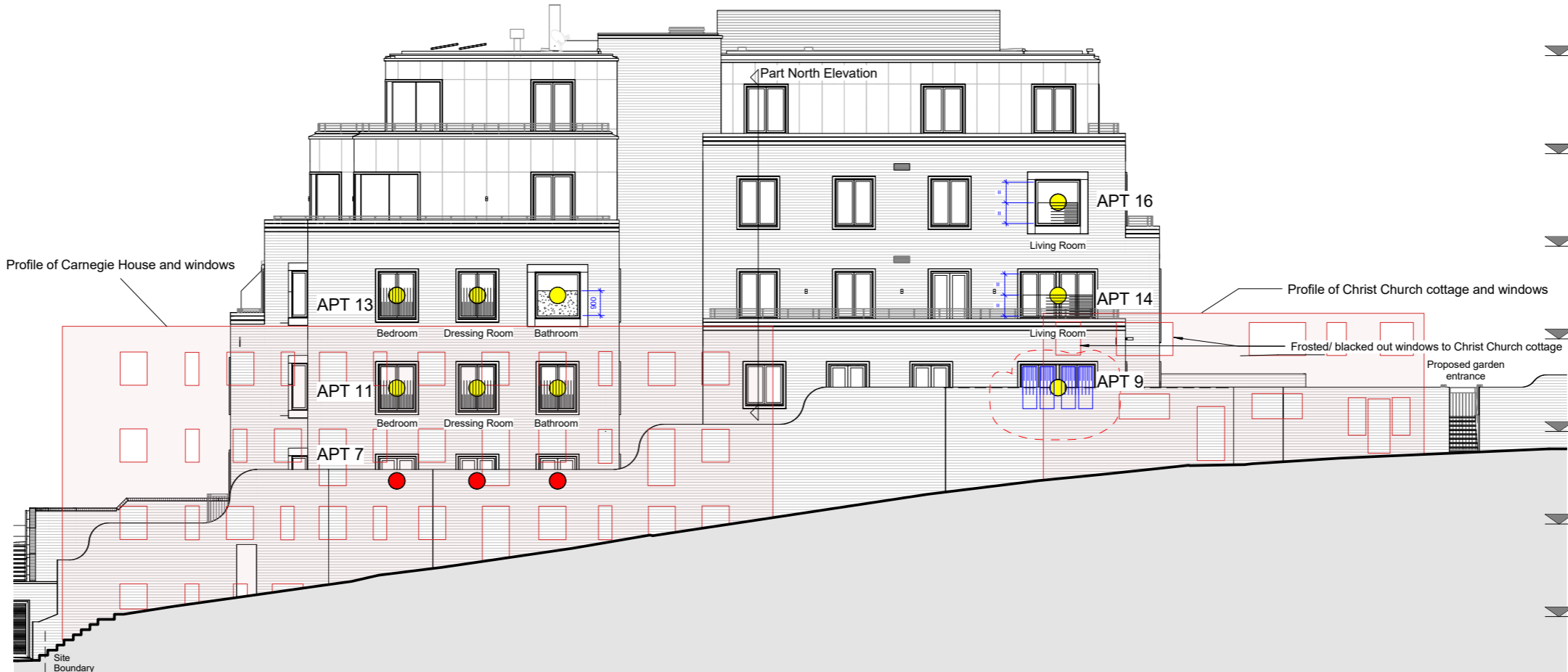
2 East Site Elevation - Overlooking 1 : 100

Note: Obscuring not required for planning