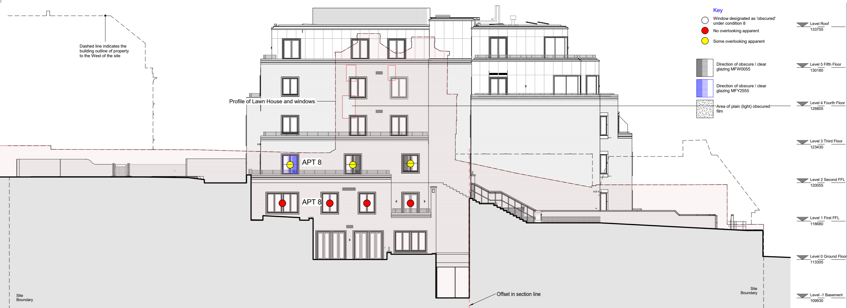
1 Section West Elevation (lightwell)-Overlooking 1 : 100