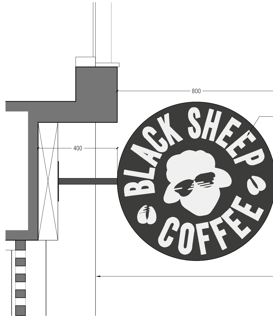
Projecting Sign Side Elevation

Logo fret cut directly into 2mm folded aluminium sign housing. Lettering and graphics faced with 5mm opal 050 acrylic. LED's housed within sign to provide static face illumination to logo