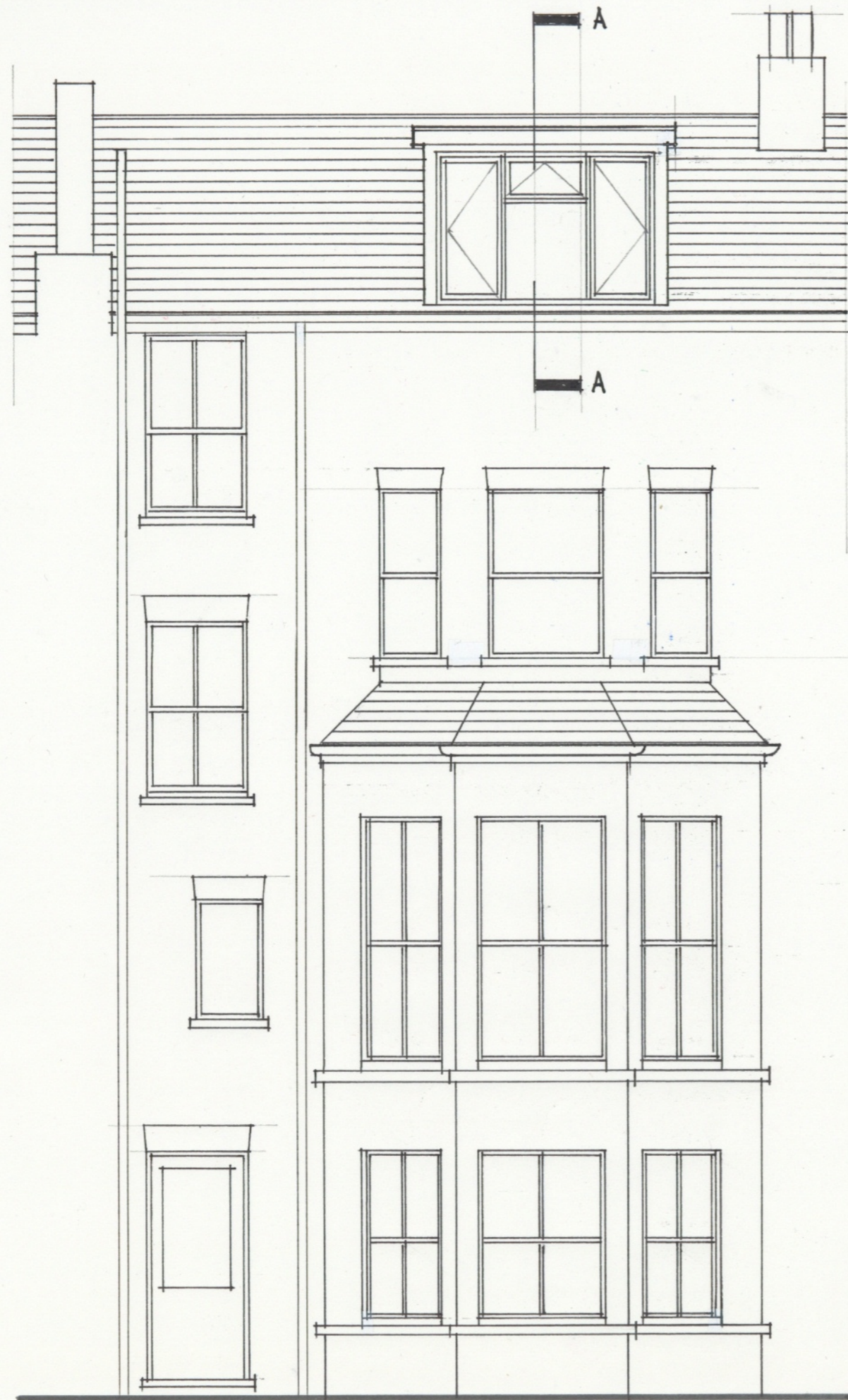
EXISTING REAR ELEVATION. SCALE: 1:50 @ A3.