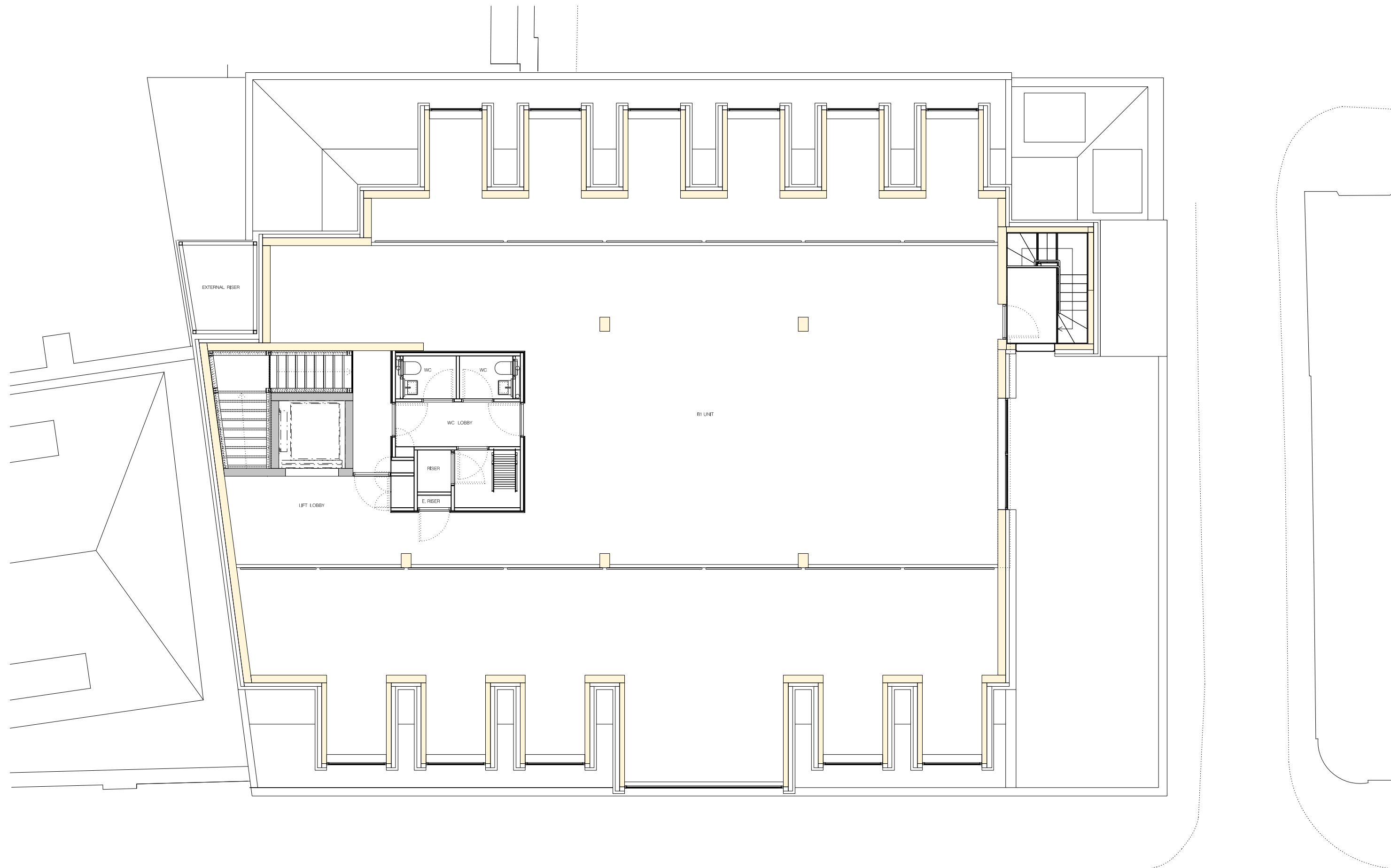
① MEZZANINE FLOOR PLAN