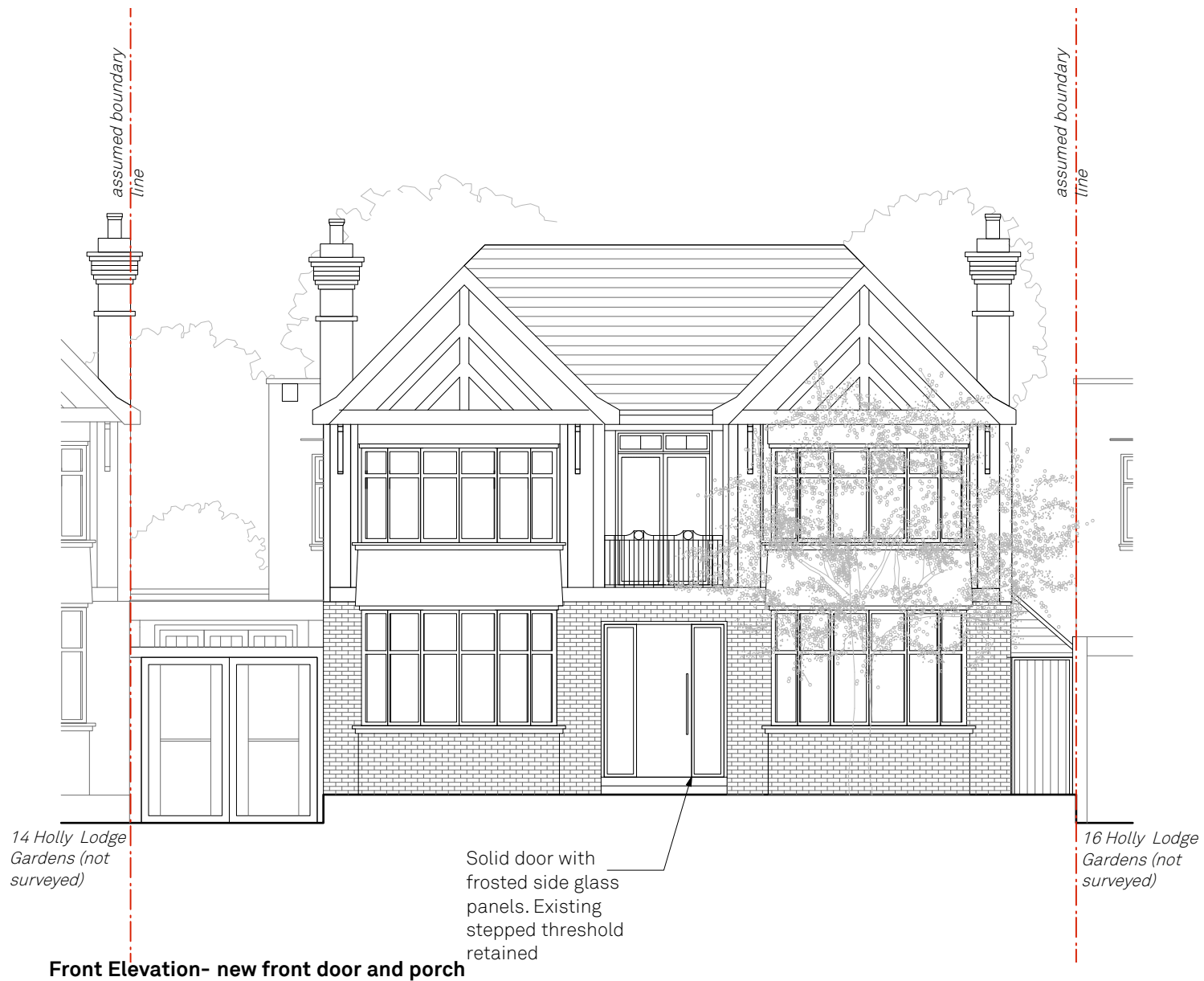
Front Elevation- new front door and porch