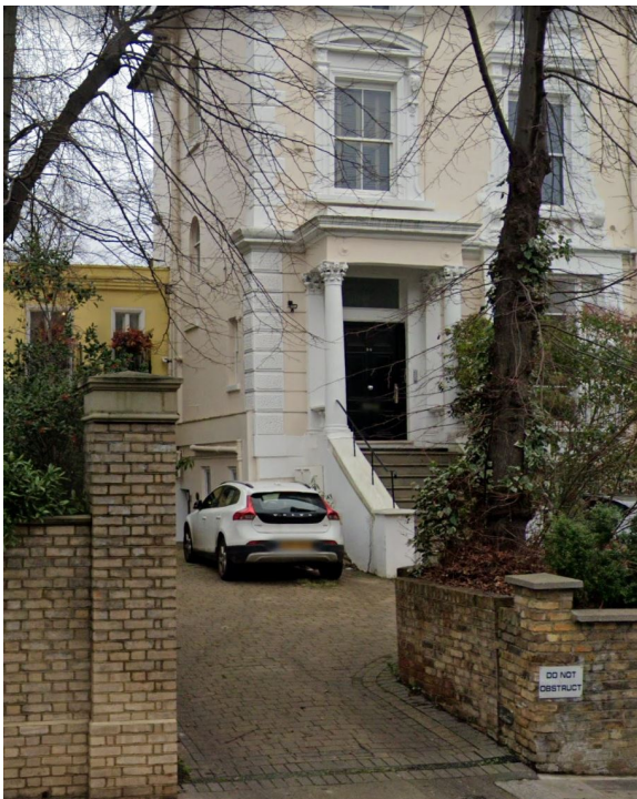
98 Haverstock Hill Front Approach with Metal Handrail at Steps