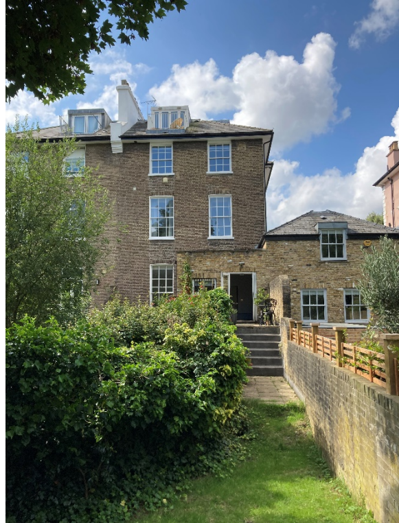
102 Haverstock Hill - Existing Rear Façade