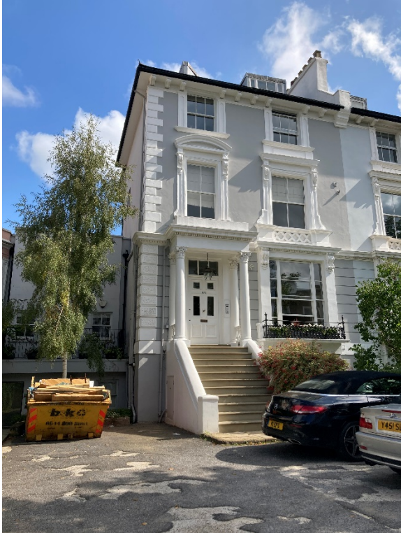
102 Haverstock Hill - Existing Front Façade