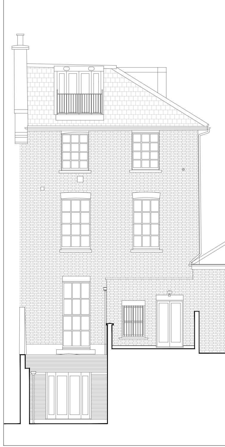
EXISTING REAR ELEVATION (NO CHANGE PROPOSED)