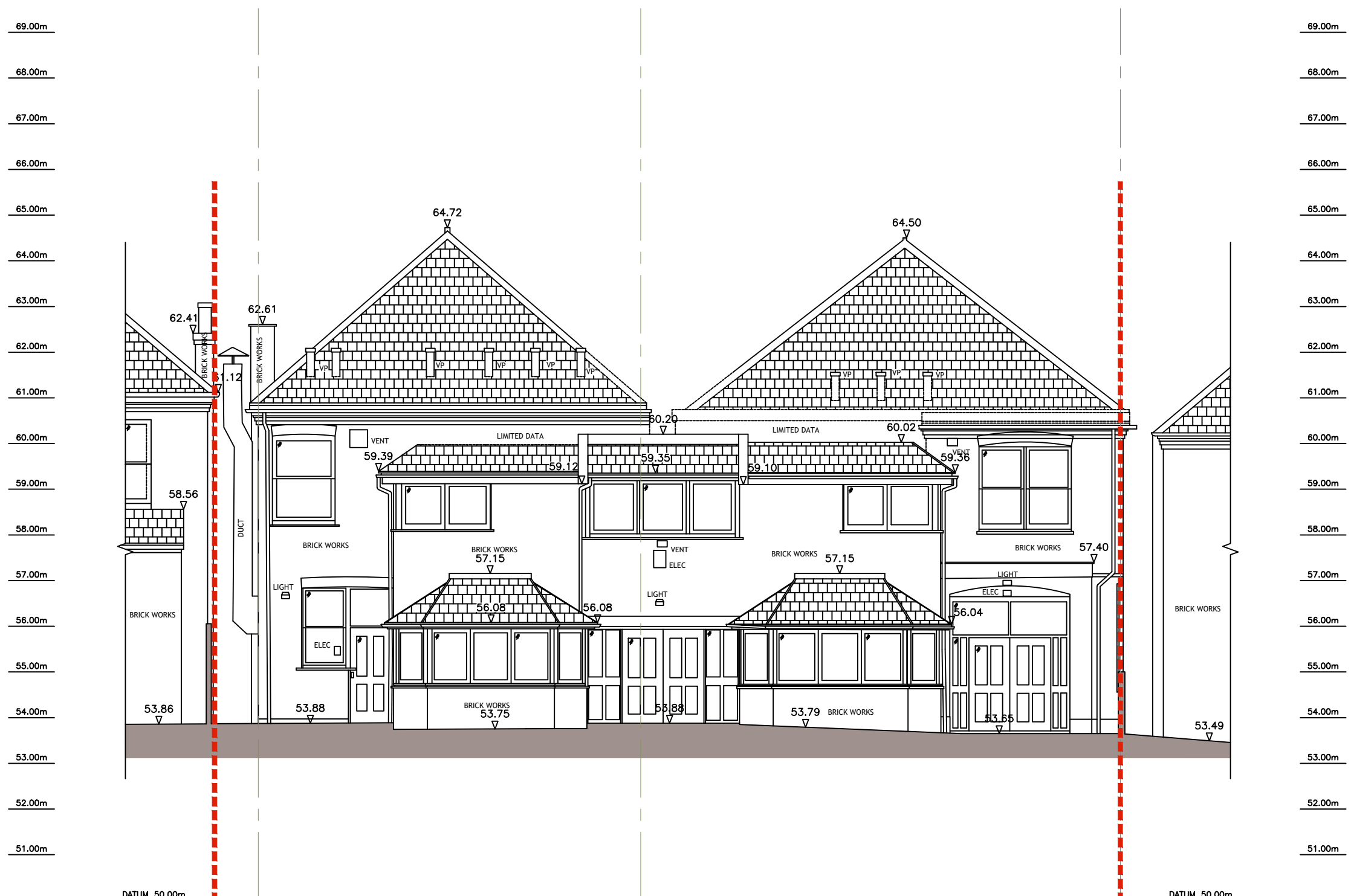
EXISTING ELEVATION NO.3

THIS DRAWING IS TO BE READ IN CONJUNCTION WITH ALL OTHER RELEVANT DRAWINGS AND SPECIFICATIONS THIS DRAWING HAS BEEN PREPARED FOR IDENTIFICATION PURPOSES ONLY. VERIFICATION OF DRAWN INFORMATION TO BE CARRIED OUT BY CONTRACTOR PRIOR TO OTHER USE. ALL DIMENSIONS TO BE CHECKED ON SITE, AND SUCH DIMENSIONS TO BE THE CONTRACTORS RESPONSIBILITY. DRAWING ERRORS AND OMISSIONS TO BE REPORTED TO THE CONTRACT ADMINISTRATOR.