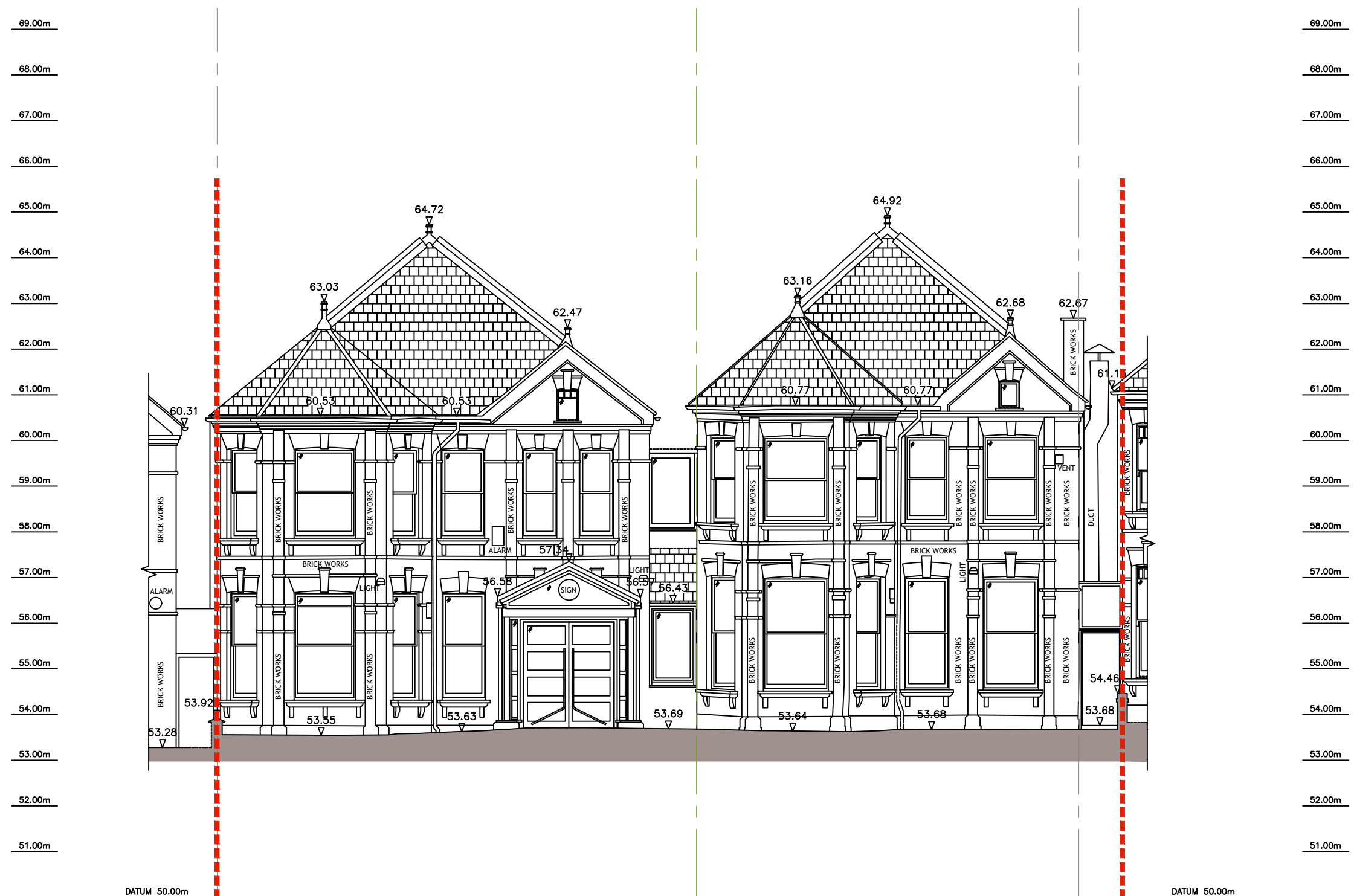
EXISTING ELEVATION NO.1

NOTE THIS DRAWING IS TO BE READ IN CONJUNCTION WITH ALL OTHER RELEVANT DRAWINGS AND SPECIFICATIONS THIS DRAWING HAS BEEN PREPARED FOR IDENTIFICATION PURPOSES ONLY. VERIFICATION OF DRAWN INFORMATION TO BE CARRIED OUT BY CONTRACTOR PRIOR TO OTHER USE. ALL DIMENSIONS TO BE CHECKED ON SITE, AND SUCH DIMENSIONS TO BE THE CONTRACTORS RESPONSIBILITY. DRAWING ERRORS AND OMISSIONS TO BE REPORTED TO THE CONTRACT ADMINISTRATOR.