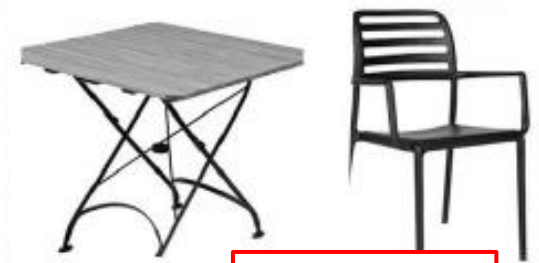
Table: 70x70 cm Chairs 45 x 45cm

3 tables and 6 chairs on Whitfield Street side area 5.2m x 0.70m