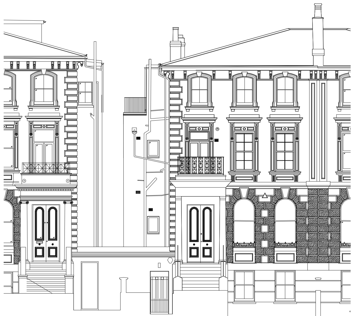
Existing Front Elevation 1:100@ A3