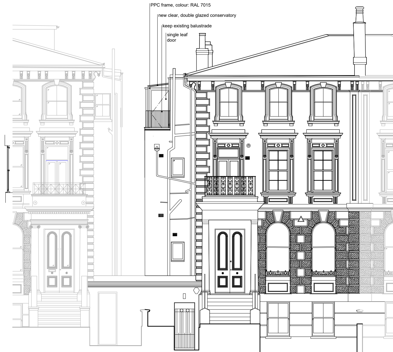
Proposed Front Elevation 1:100@ A3