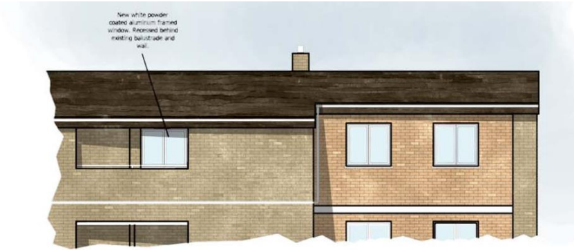
Proposed Elevation B-B