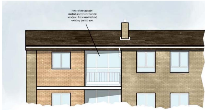
Proposed Elevation A-A