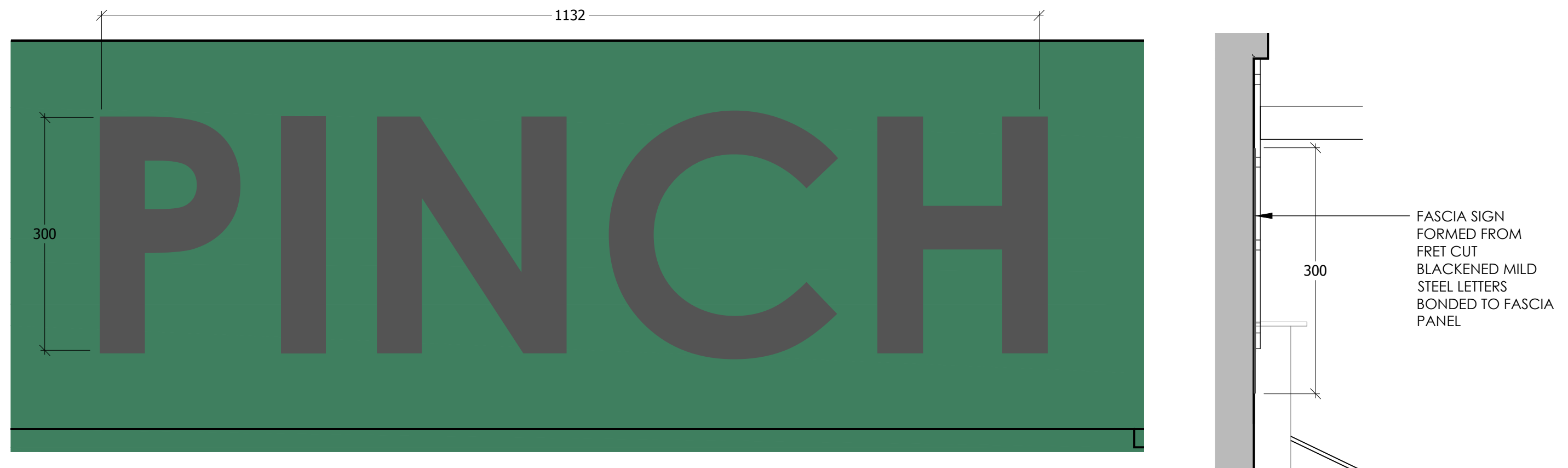
05 FASCIA SIGN ELEVATION Scale: 1:5 @ A1