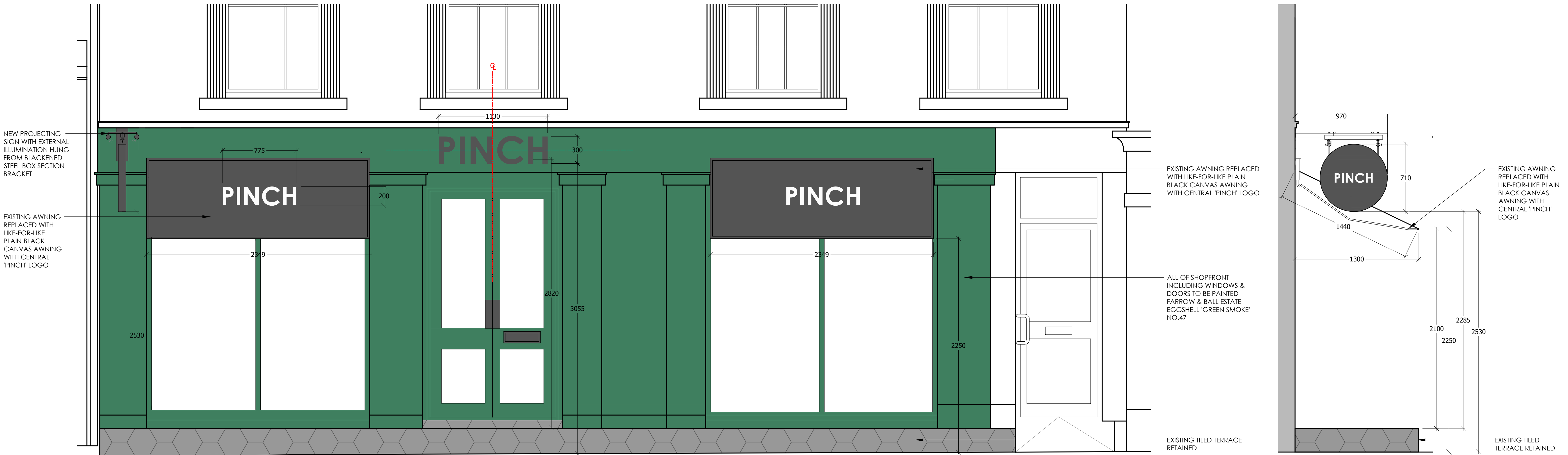
01 SHOPFRONT ELEVATION Scale: 1:20 @ A1