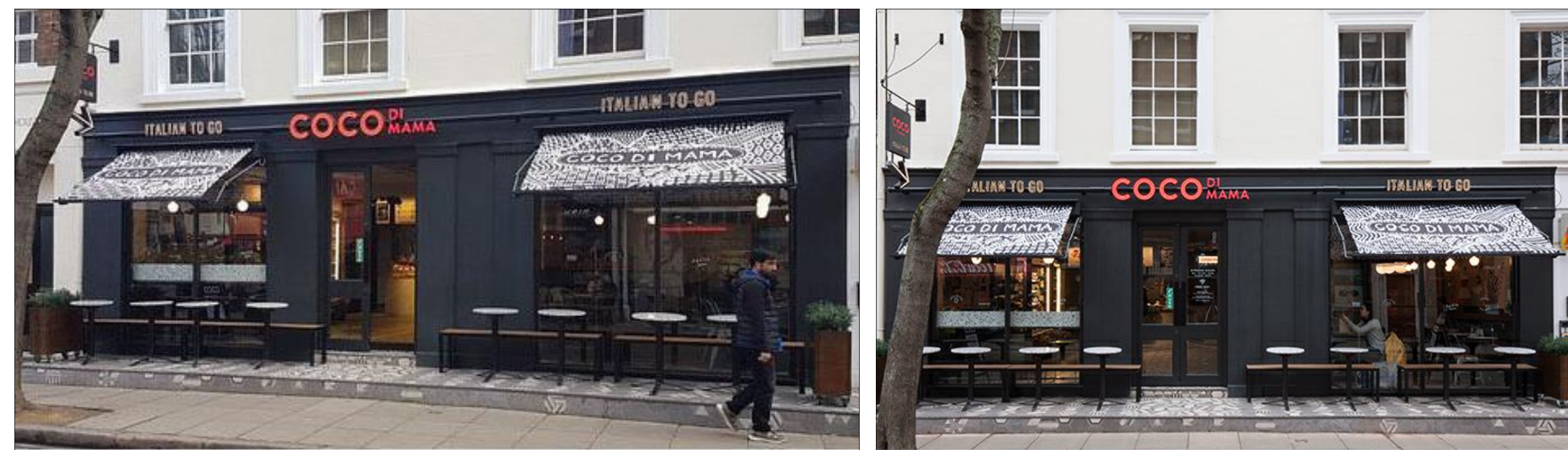
07 EXISTING SHOPFRONT PHOTOS