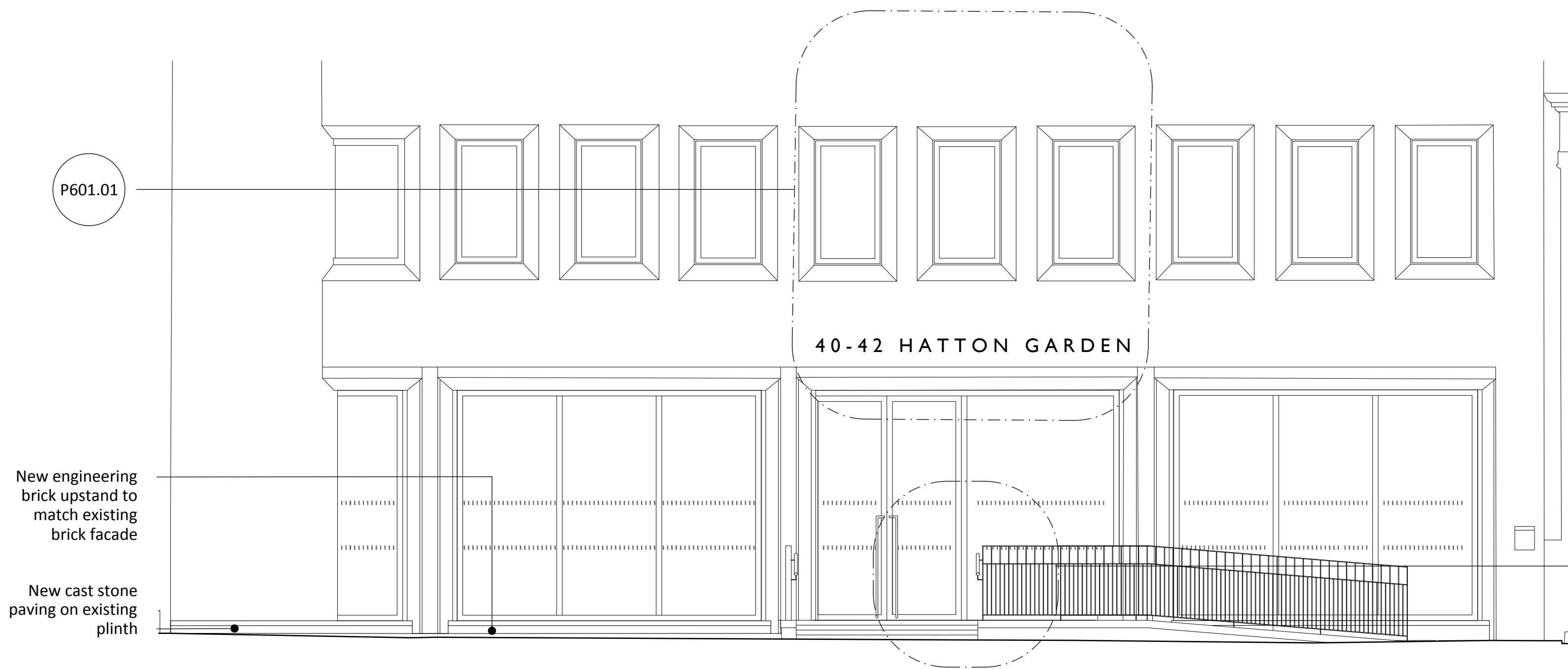
01 NORTH ELEVATION