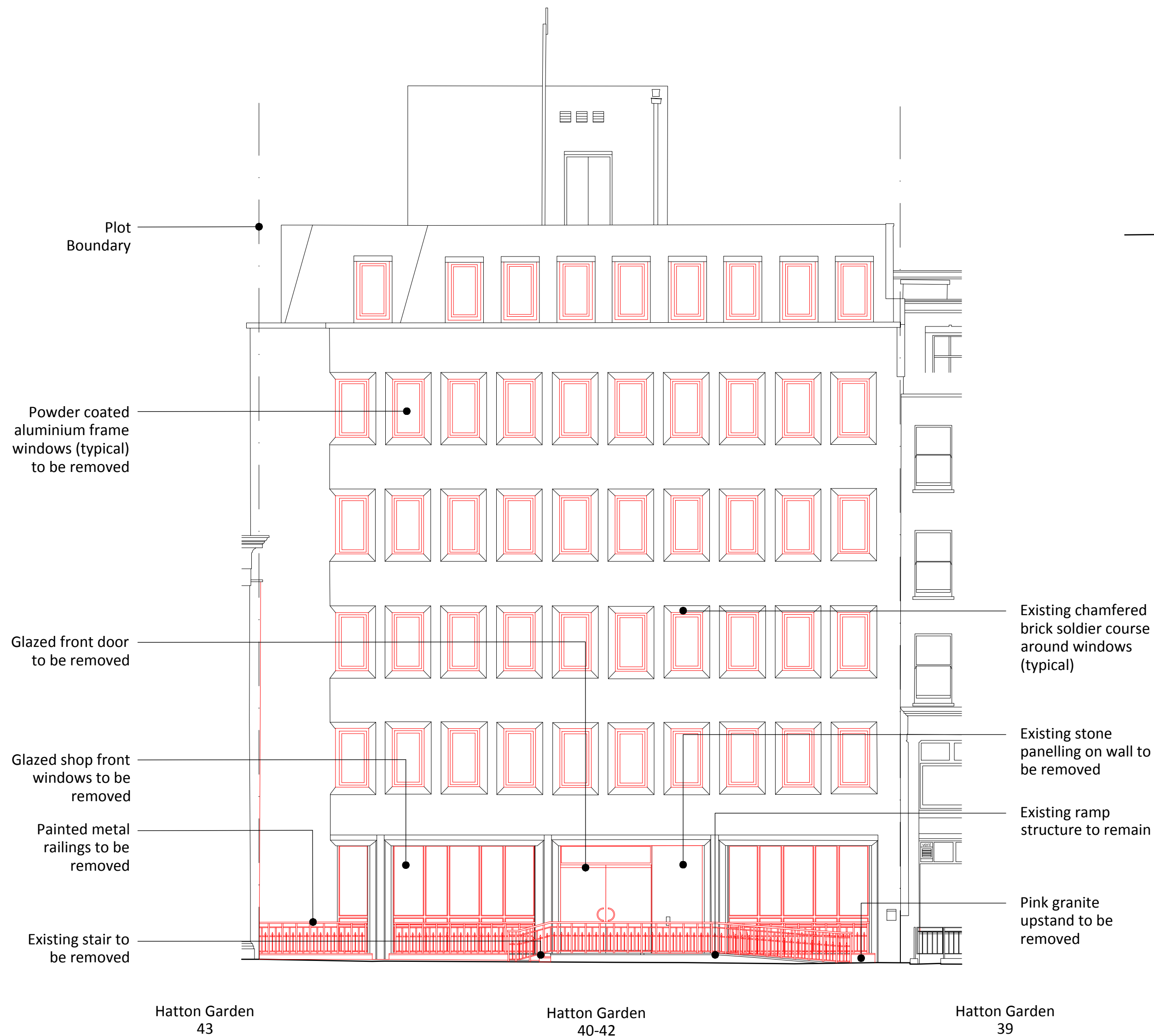
01 WEST ELEVATION (STREET FRONTAGE)