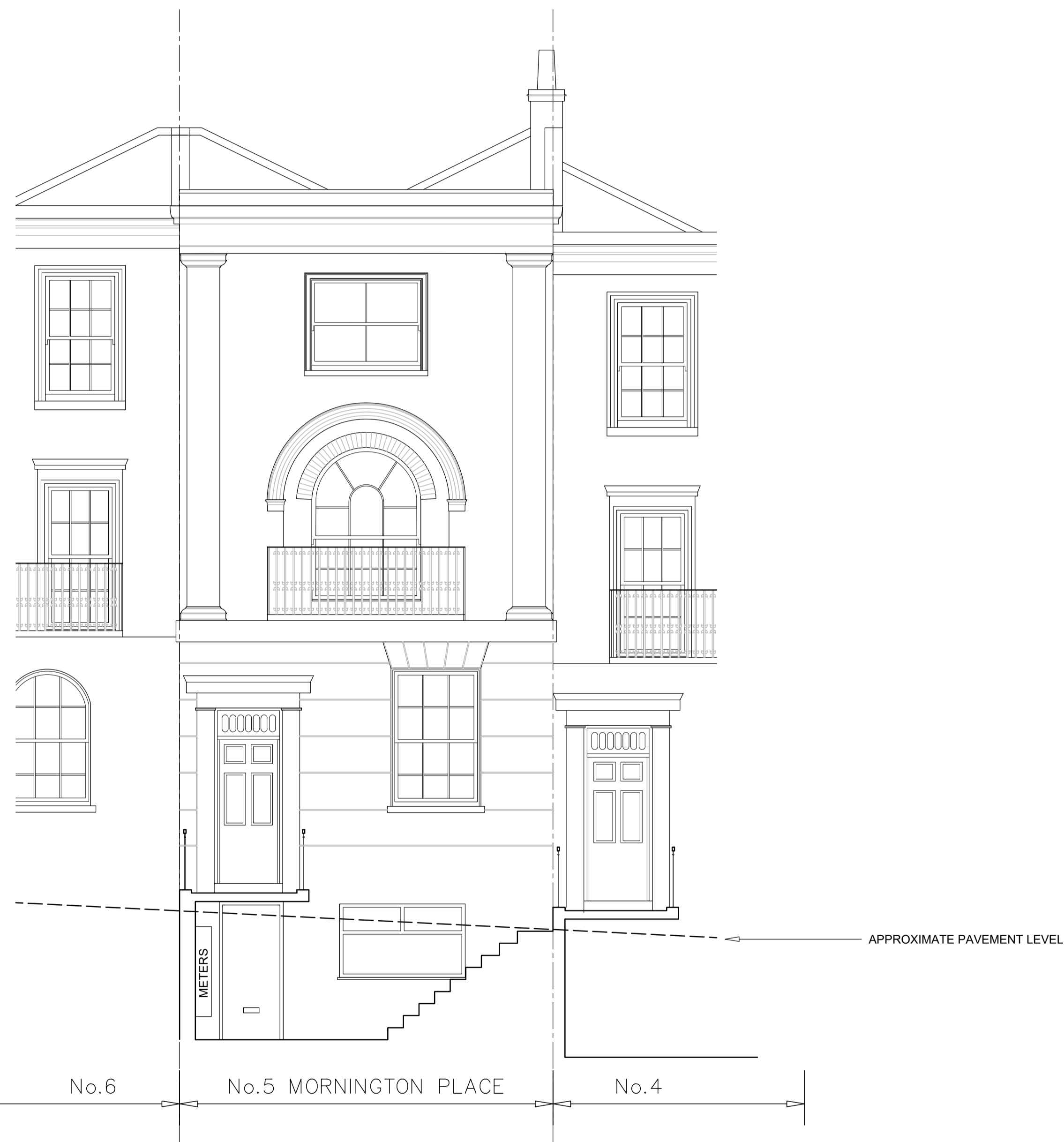
FRONT (SOUTH) ELEVATION