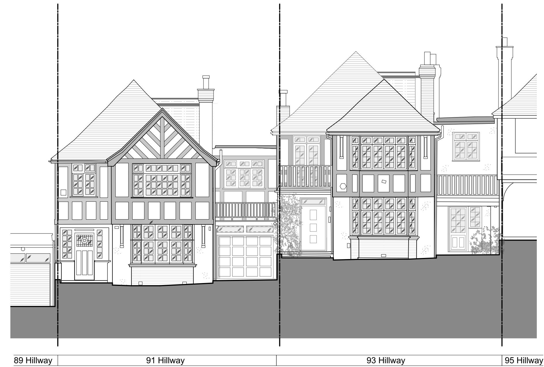
2 House front elevation Scale: 1:100