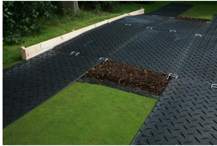
Temporary Ground Protection

Arboriculturalist to visit site at regular intervals to check protection measures