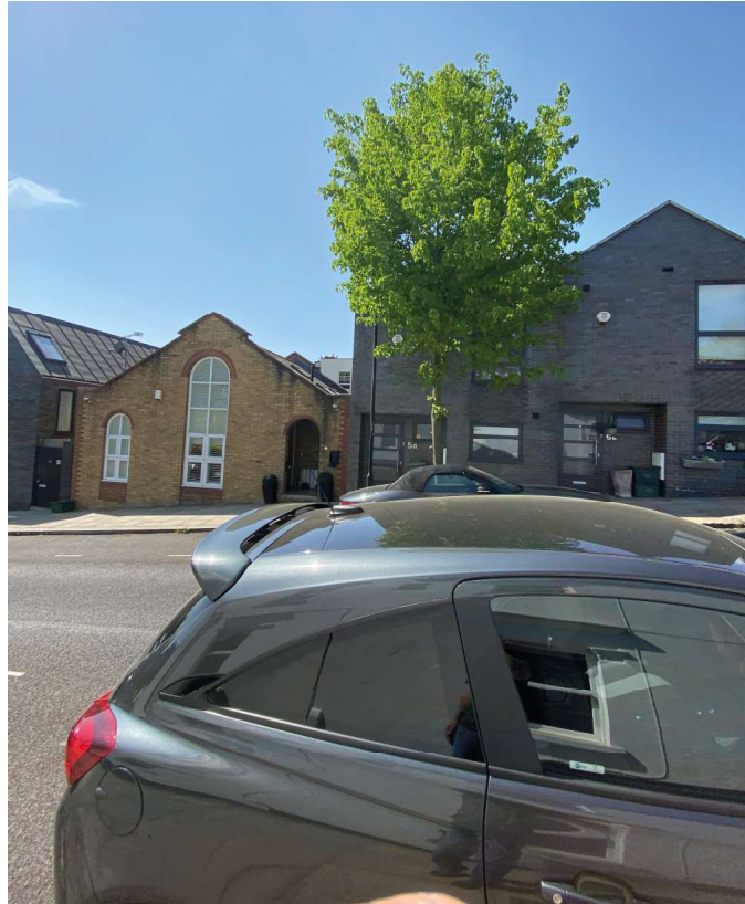
Looking down Gondar Gardens - differing heights of existing units