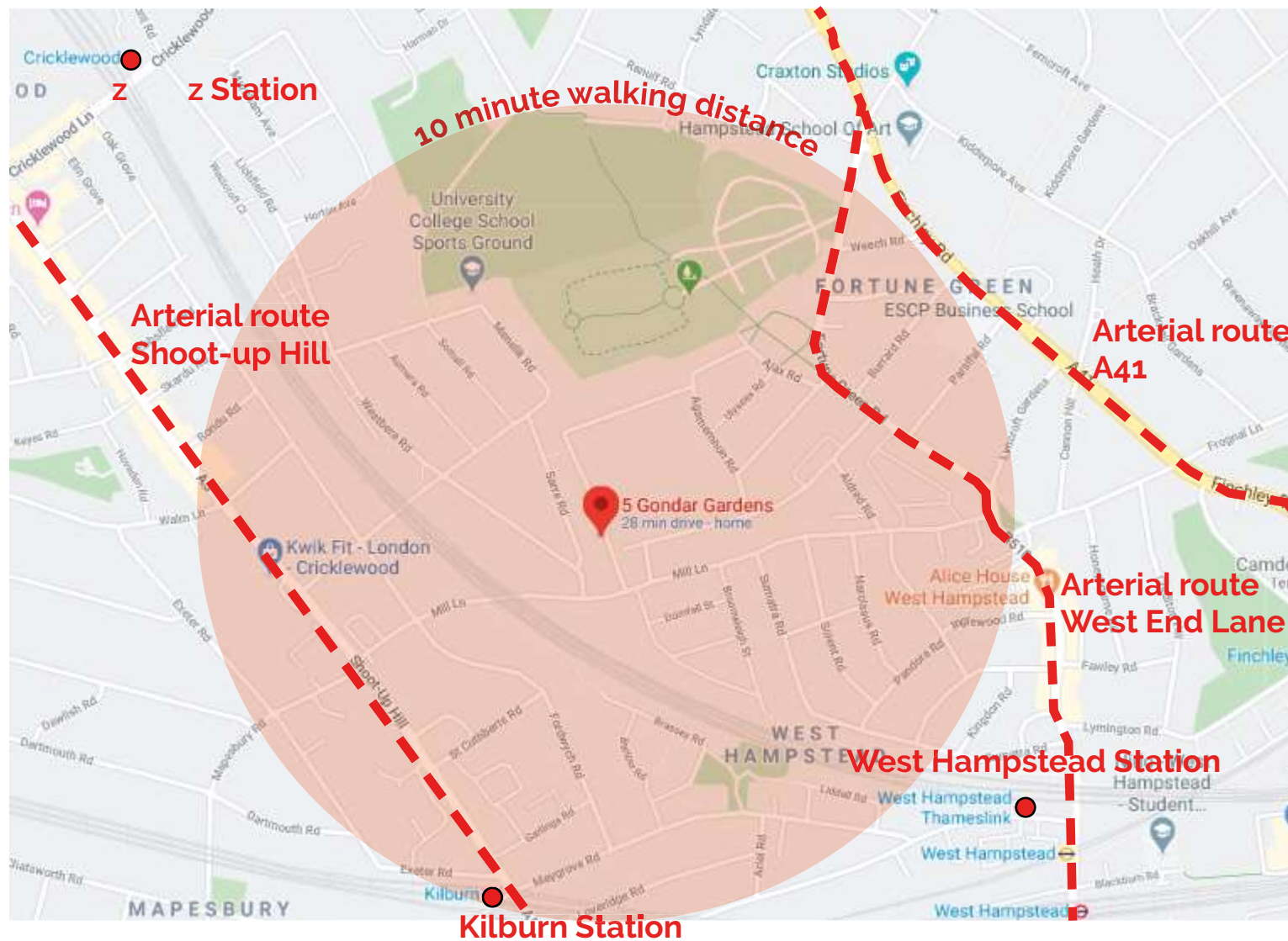
Local access routes diagram