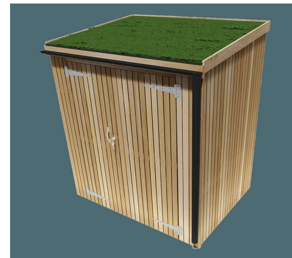
Bike store to be located in rear garden to z 3 bikes

The existing hard-standing to the rear is currently used by visitors to the property to park and one space is used rented to a local business so that they can park. Going forward the local business will have to utilise public transport as will visitors or the owner of 12 Sarre Road will have to provide visitor parking permits to Sarre Road. This would be the case in both instances if the hard standing did not exist.