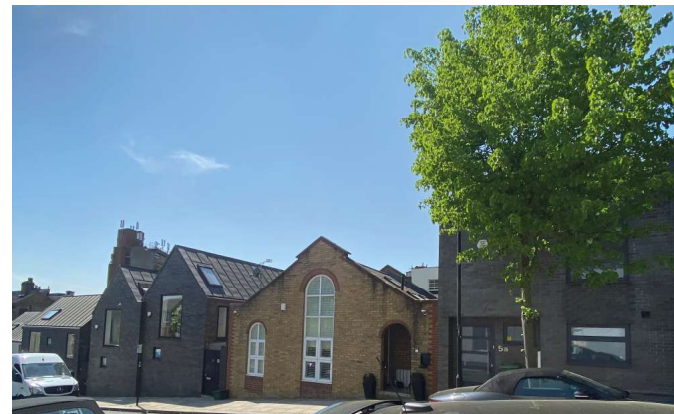
Further down Gondar Gardens with differing styles