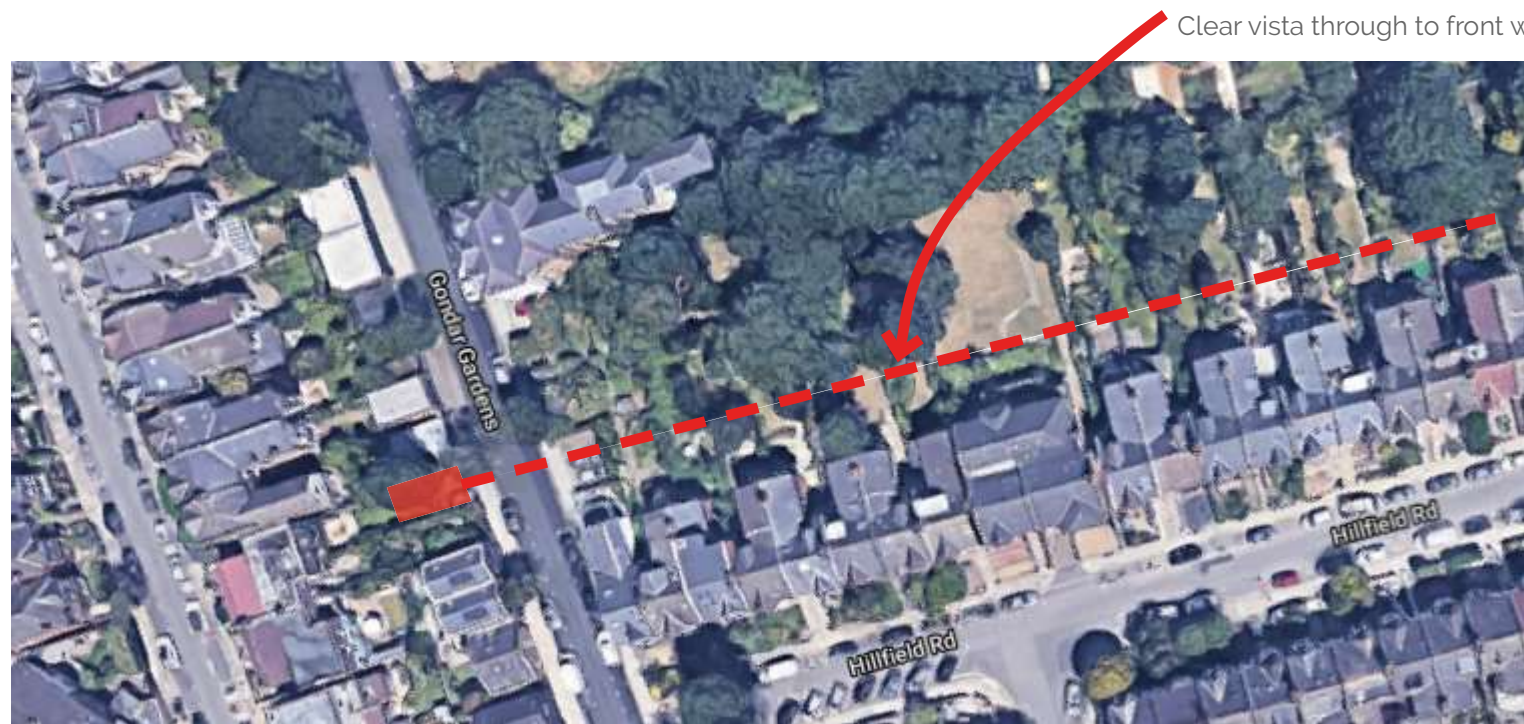
Site plan to show no overlooking issues with terrace