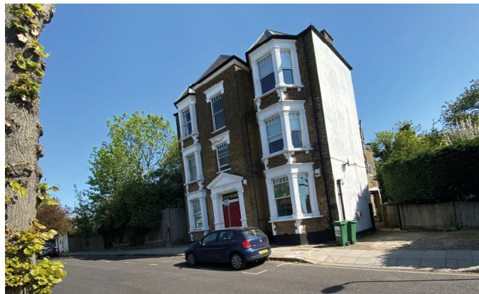
Opposite side of Gondar Gardens - large 3 storey unit