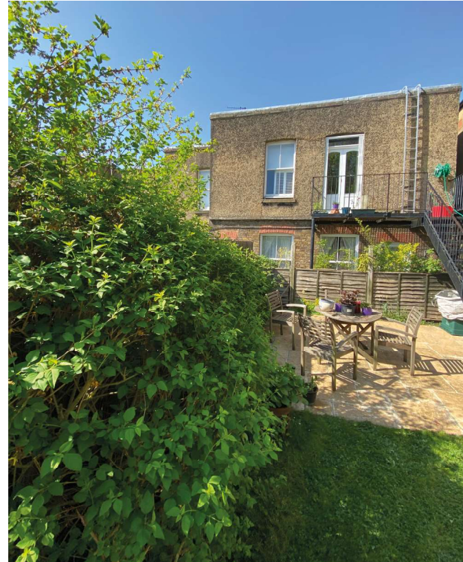
Rear of No.12 Sarre Road with fencing and screening to ground floor