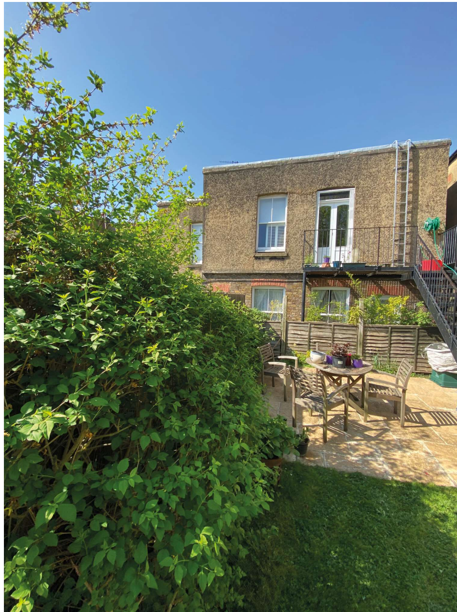
Rear of No.12 Sarre Road showing existing fencing and foliage screening