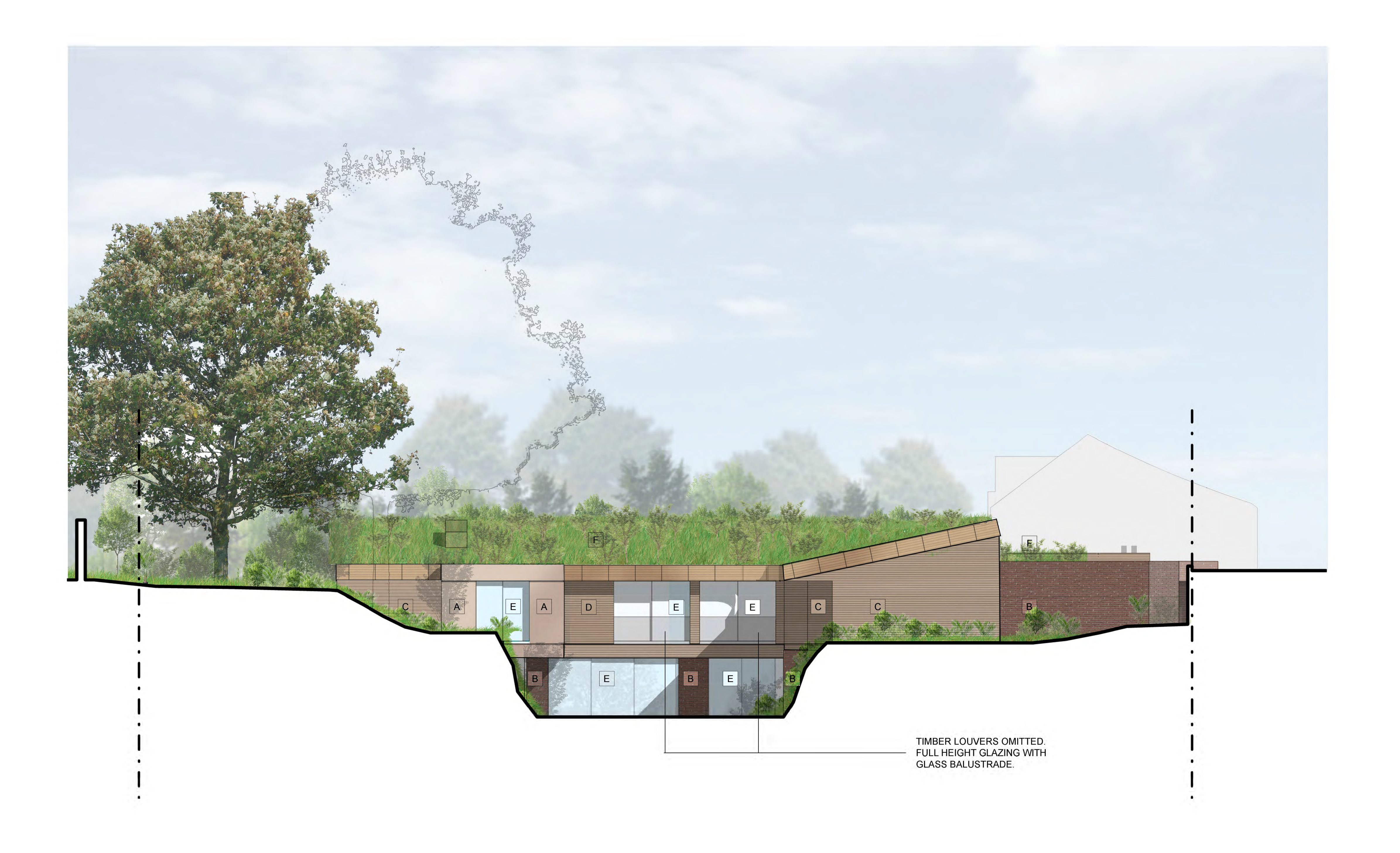
PA 301 NORTH ELEVATION 1:100