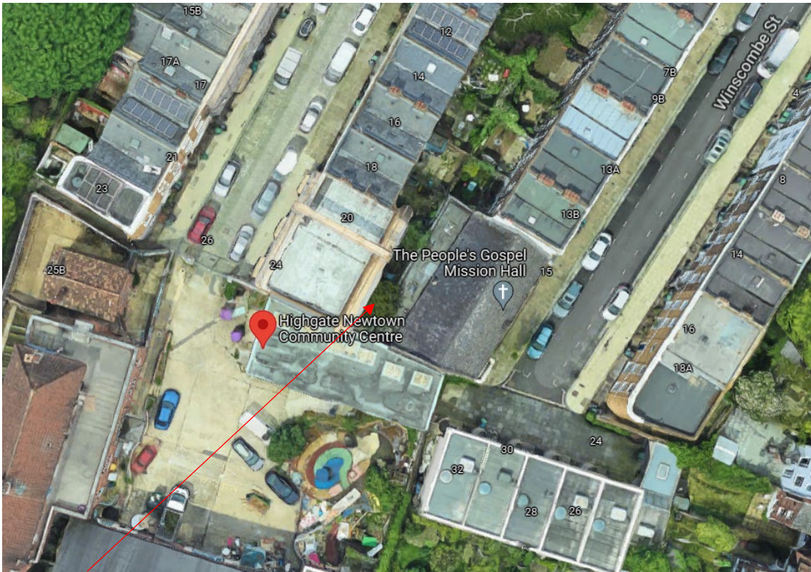
T1 Arrowed. Not to Scale.