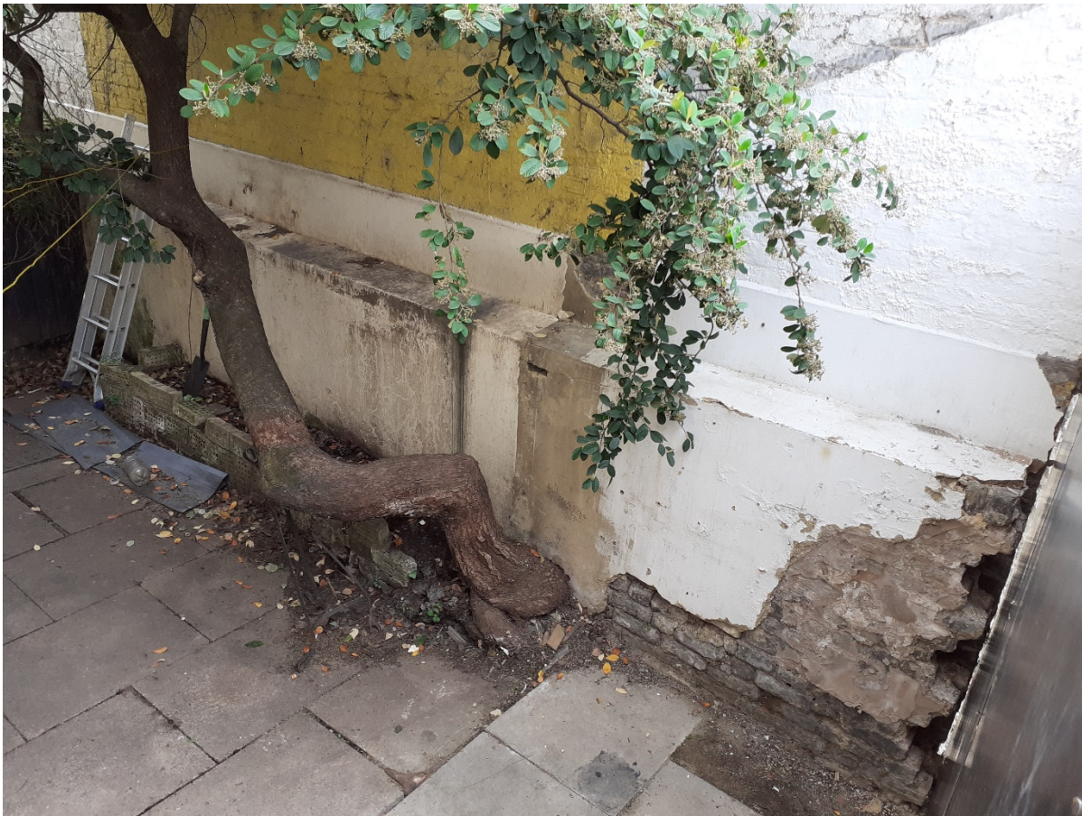
Plate 2: As for Plate 1.