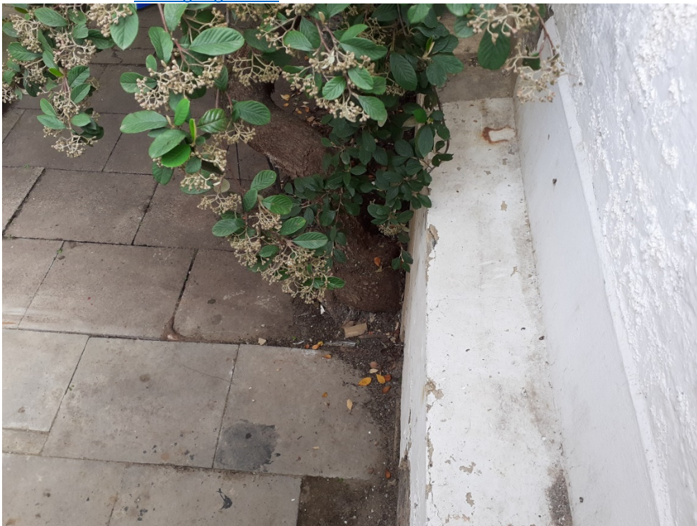
Plate 1: View at base of T1 to be removed.