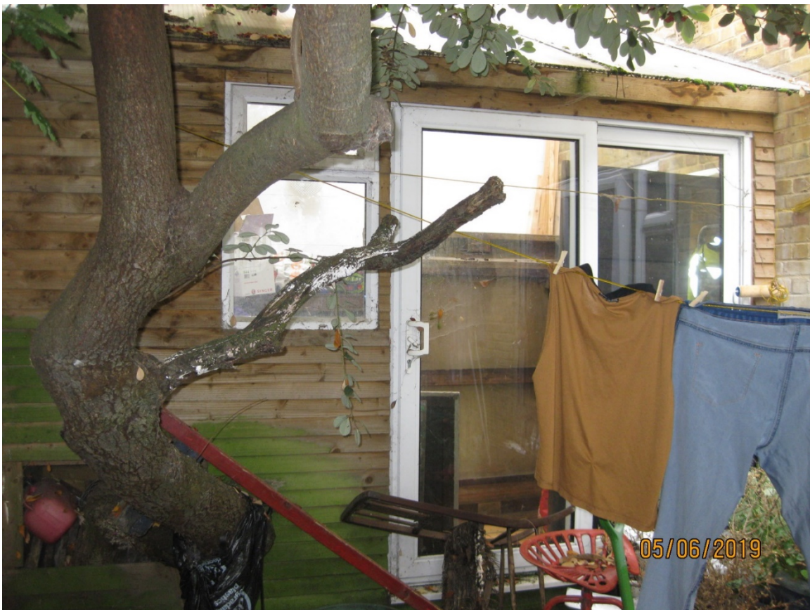
Plate 3: Detail of T1 illustrating its accidental development in unsuitable location.