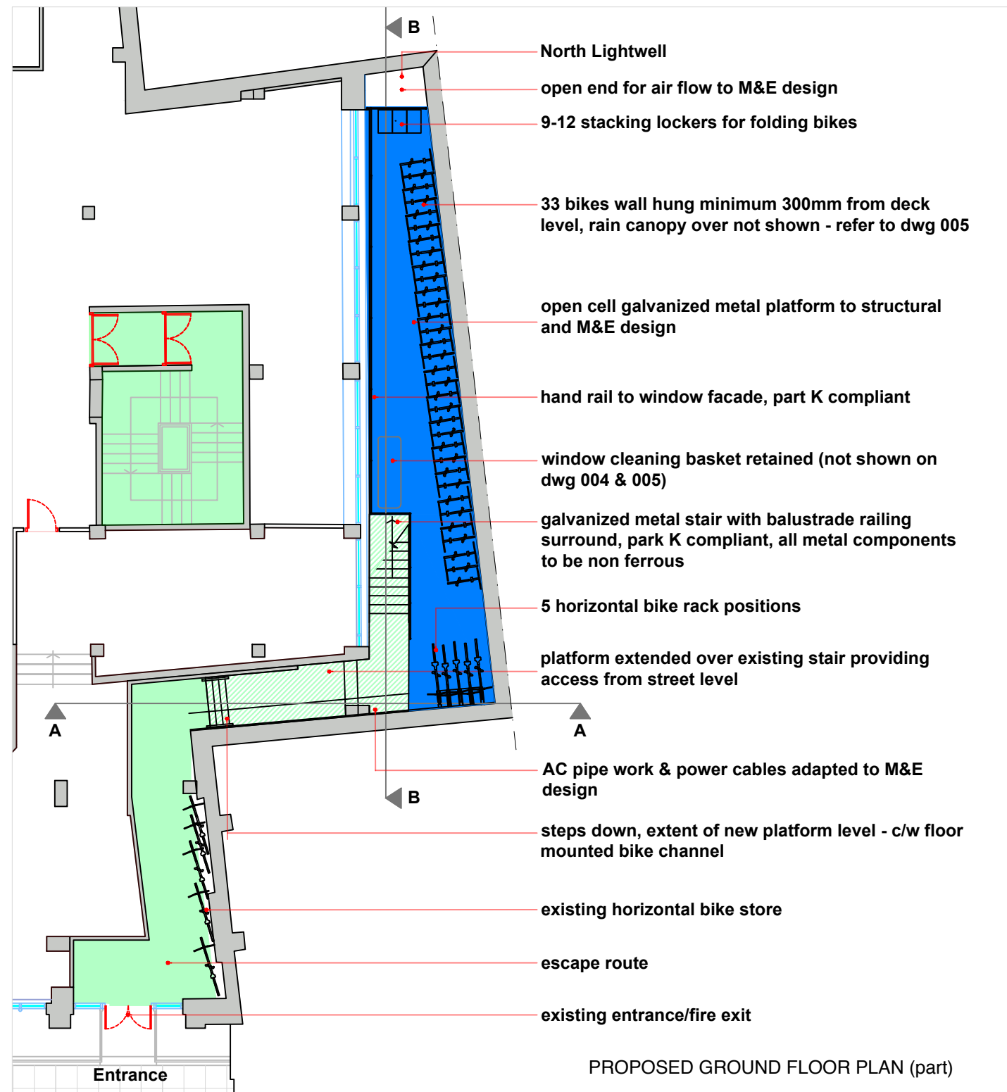
PROPOSED GROUND FLOOR PLAN (part)