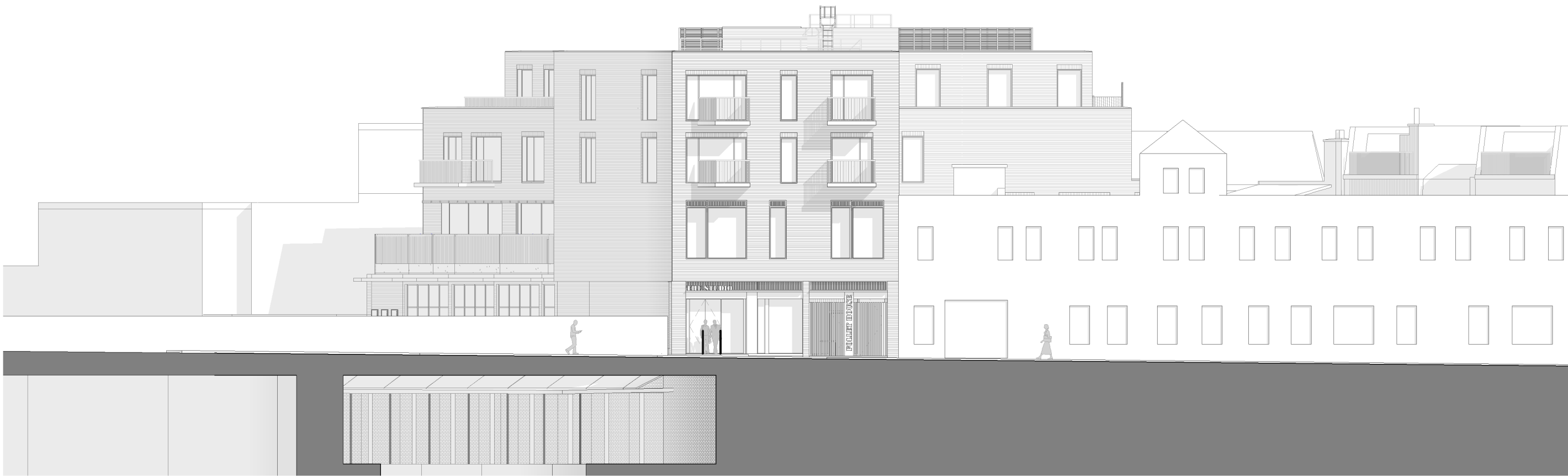
1 Proposed - Leeke Street Elevation Scale: 1 : 200