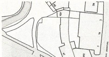
Site Location Plan 1:1

NB: If a hard copy of this drawing is to be printed, a further scale of 1:500 may be used. The original scale has been reproduced accurately. Visual scale on the drawing.