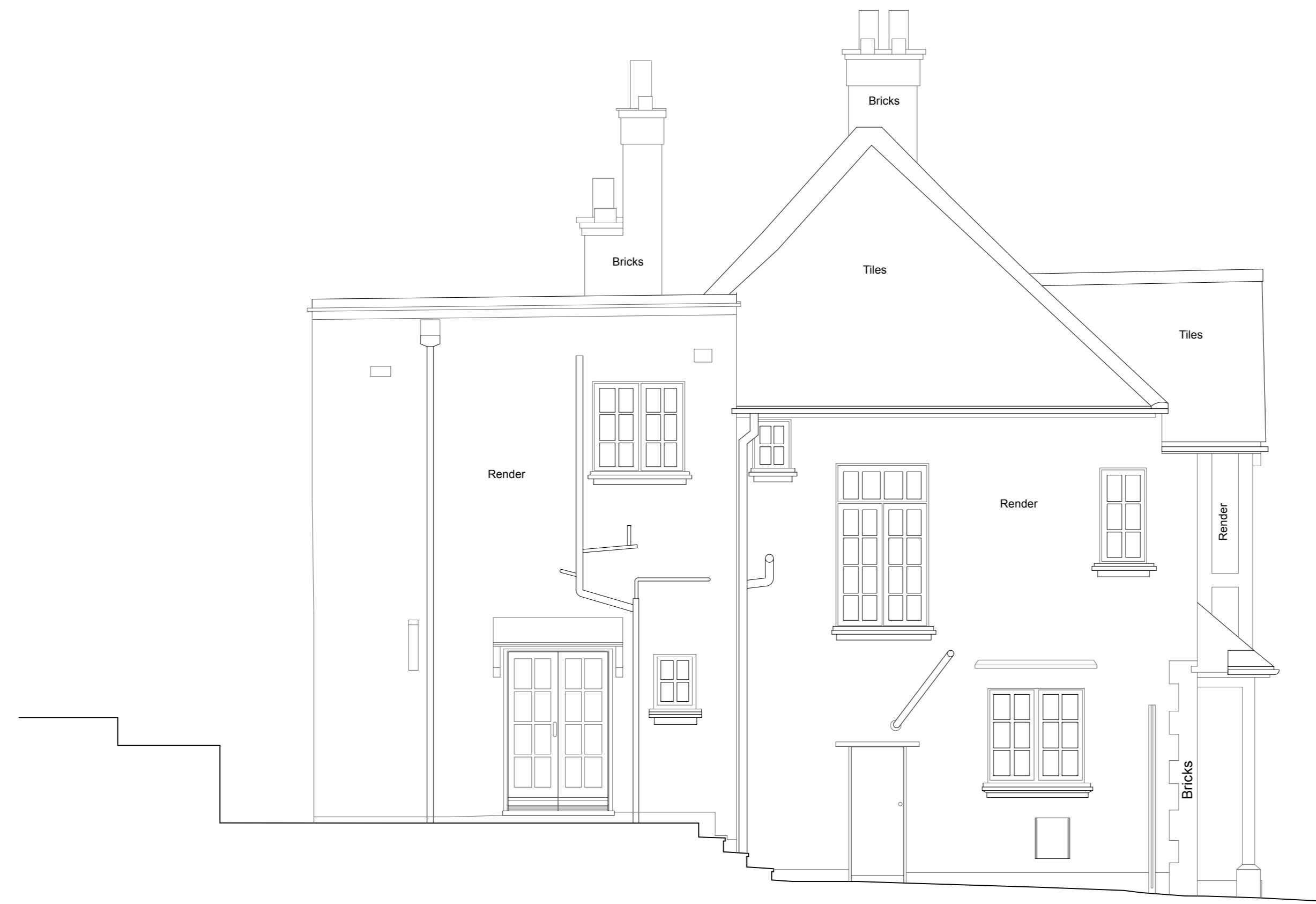
1 Existing Side Elevation P-300 Scale: 1:50