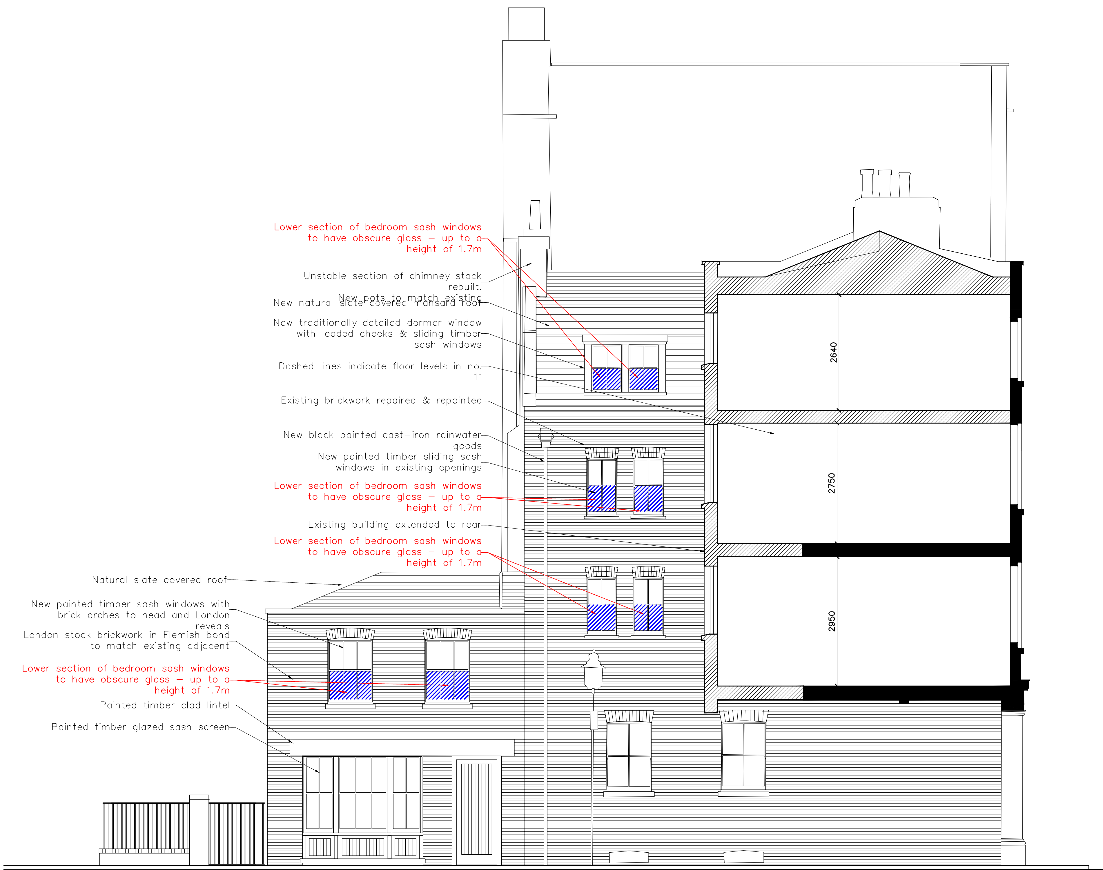
Section A-A As Approved Scale 1:50